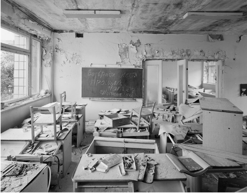
Figure 3 Robert Polidori, Classroom, Pripyat , 2001. Published in Polidori (2006, cover and 41).