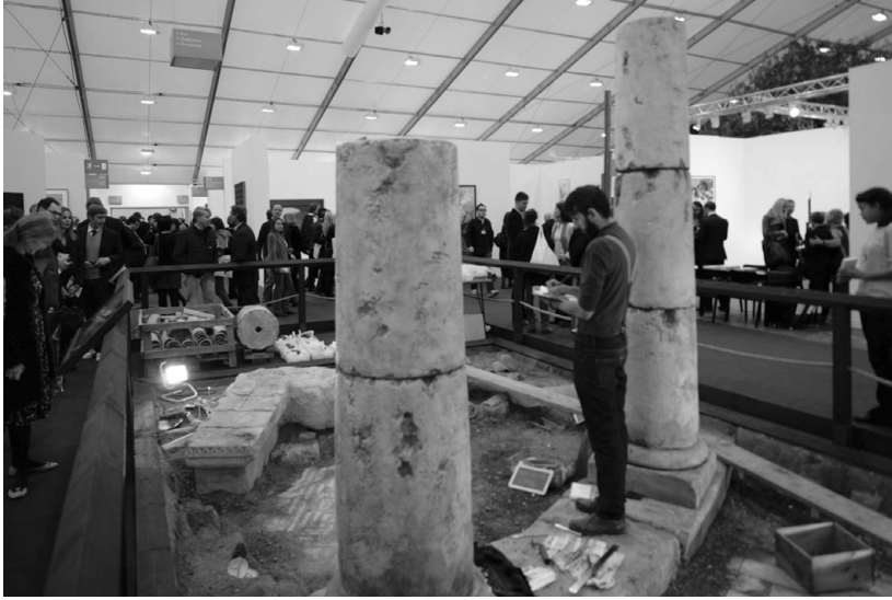
Figure 2 Simon Fujiwara, Frozen city , Frieze Art Fair, London 2010. © Simon Fujiwara, courtesy of Simon Fujiwara and Galerie Neue Alte Brücke, Frankfurt am Main.

of art (figure 2). In the panels which accompanied a series of viewing platforms which looked across the subterranean archaeological excavations, he playfully satirized the excess and decadence of the contemporary art world using archaeology as a tool to simultaneously produce a sense of distance and ‘otherness’ by turning the archaeological lens on ourselves. A similar theme was evident in the artist Mark Dion’s Tate Thames dig (Dion 1999; see discussion in Renfrew 2003, 84; and Harrison and Schofield 2010, 116). In a very real sense, this is what many archaeologists have sought to do through their work on the present – to draw attention to the everyday by making it ‘uncanny’ and to explore archaeology itself as a contemporary cultural phenomenon. One of the problems is that in doing so, archaeologies of the contemporary past have played out one of the fundamental modernist underpinnings of the discipline – the production of a past which is distant, alien and ‘other’ to ourselves (Graves-Brown, forthcoming). This has undermined any aim which the archaeology of the contemporary past might have of reducing the distance between past and present, and making the past more accessible, egalitarian or knowable.