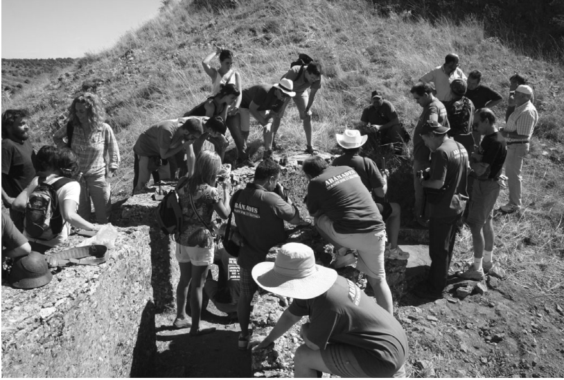
Figure 1 On the surface, from the depths: the moment of discovery of a helmet during the excavation of a trench from the Spanish Civil War (1936–39).