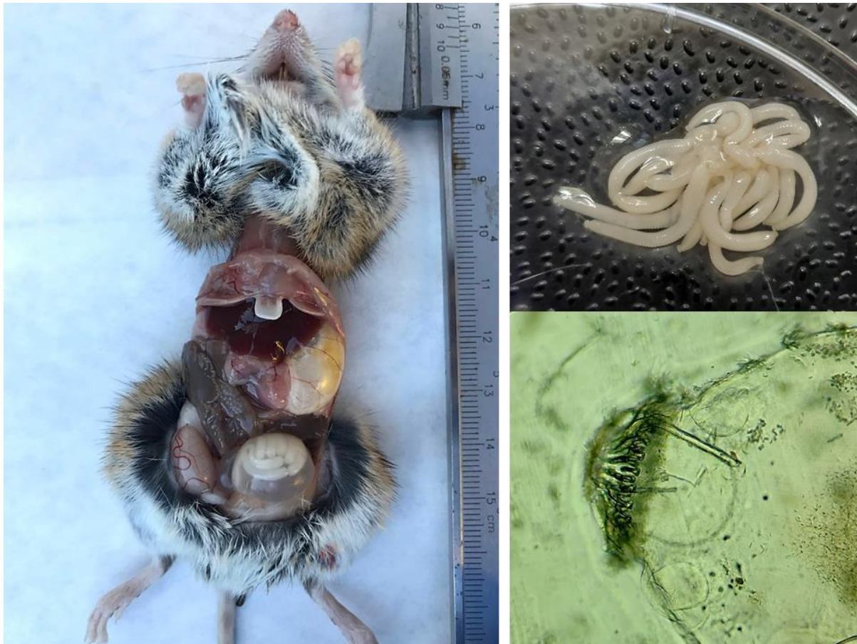
Figure 1. A: a wood mouse with an abdominal cyst; B: larvae extracted from the cyst; C: a microscope image of the rostellum.