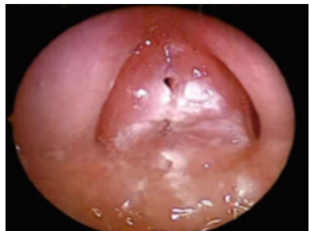
FIG. 3 Laryngoscopic view before laser debulking.