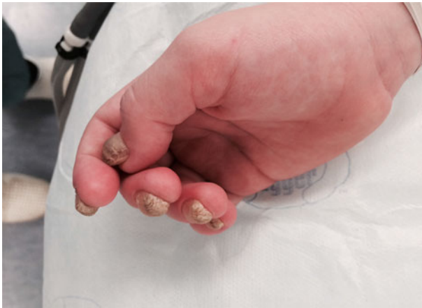
FIG. 1 Thickened fingernails.

The patient underwent laryngoscopy and bronchoscopy, which revealed laryngeal obstruction due to vocal fold oedema and keratin plaques on the true vocal folds and epiglottis (Figure 2). The keratosis was debulked. After a failed trial extubation in the operating theatre, the patient remained intubated for 7 days in the paediatric intensive care unit, receiving antibiotics and steroids. He was discharged 3 days following extubation.