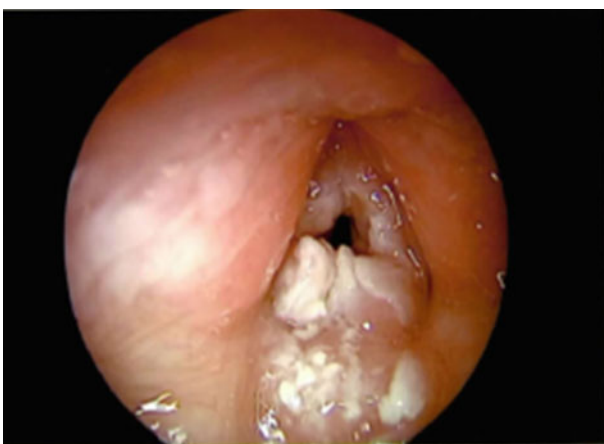
FIG. 2 Laryngoscopic view at first presentation.

Although laryngeal involvement is rare in patients with pachyonychia congenita, it has the potential to be life-threatening because of airway obstruction. There have been four other reported cases describing this complication in the literature. 10–13 Upper respiratory tract infection appeared to be a precipitating factor in developing airway compromise