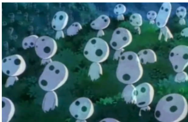
Kodama ©1997 Studio Ghibli

I wondered how to give shape to the image of the forest, from the time when it was not a collection of plants but had a spiritual meaning as well . I didn’t want the forest just to have many tall trees or be full of darkness. I wanted to express the feeling of mysteriousness that one feels when stepping into a forest – the feeling that something is watching from somewhere or the strange sound that one can hear from somewhere. When I mulled over how I could give form to that feeling, I thought of the kodama. Those who can see them do, and those who can’t don’t see them. They appear and disappear as a presence beyond good or evil. 53