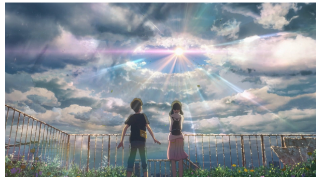
Spiritual Image in Weathering with You 44

reality in his films. The distance between the dead and the living is blurred or almost non-existent and the main characters are able to travel between both worlds in both Weathering with You and Your Name .