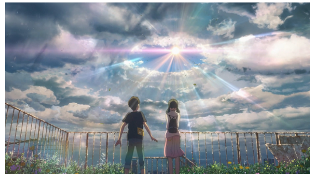
Spiritual Image in Weathering with You 44

reality in his films. The distance between the dead and the living is blurred or almost non-existent and the main characters are able to travel between both worlds in both Weathering with You and Your Name .