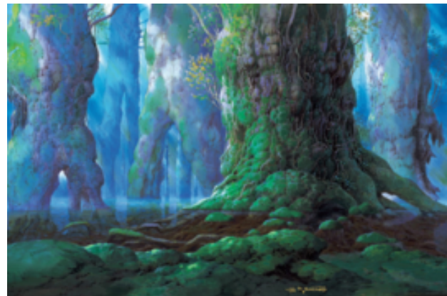
'The Forest of Shishigami no.5' in Princess Mononoke

The major characteristic of Studio Ghibli - not just myself - is the way we depict nature. We don't subordinate the natural setting to the characters. Our way of thinking is that nature exists and human beings exist within it . ... That is because we feel that the world is beautiful. Human relationships are not the only thing that is interesting. We think that weather, time, rays of light, plants, water, and wind - what makes up the landscape - are all beautiful. That is why we make efforts to incorporate them as much as possible in our work (emphasis added). 50