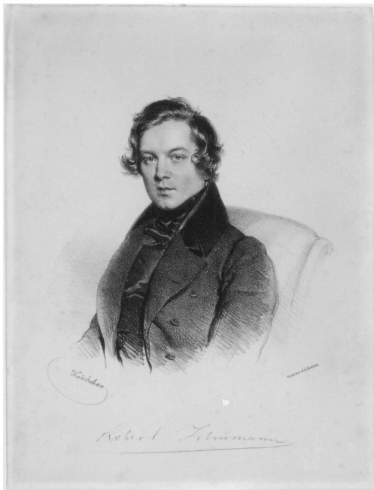
Figure 1.3 Robert Schumann (lithograph by Joseph Kriehuber, Vienna, 1839)

unresisted by critics of his late work, who regarded the compositions of the 1850s especially as mental echo-chambers of the composer's looming madness. 16 Yet, works such as the Davidsbündlertänze are more than a mere representation of Schumann's mood swings and a correspondingly dissociated inner nature, for they seem to be not only as if peopled with characters, but rather as if entirely imbued with them: as if created by them from within, and so as if becoming, in and of themselves, new and wholly independent figures in their own right. In other words, Schumann, seen as a fantasist with a disordered self, was able to explore in moments of creativity the many forms and faces, the sphinx-like inner texture and essential opacity, of the isolated human self. To escape a unified author-authority his self multiplied,