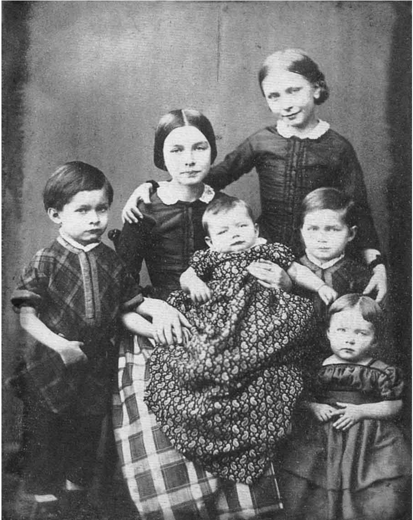
Figure 1.5 Robert and Clara Schumann's children, 1854

of people', as Wilhelm Wasielewski, one of Schumann's direct acquaintances and first biographer, reports. 24 About Schumann's way of interacting with his children, Wasielewski recalls: