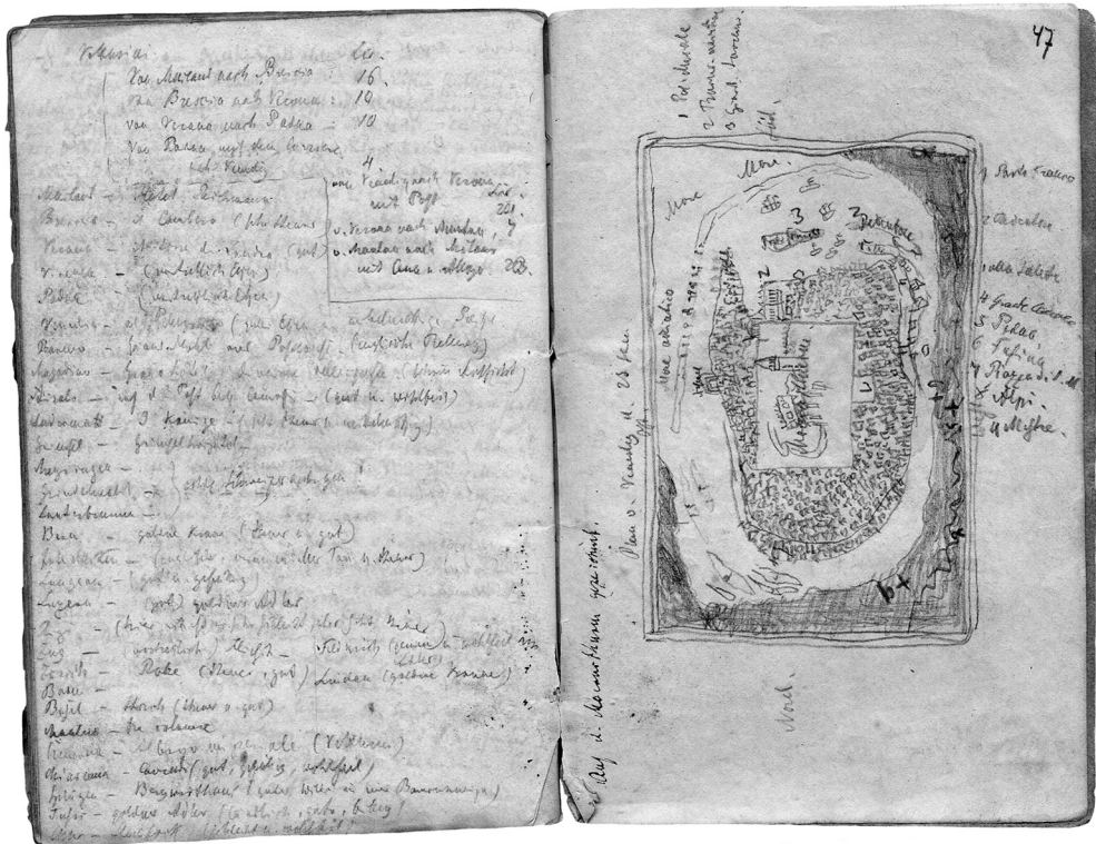
Figure 1.1 Schumann's travel notebook

Bayreuth, Nuremberg, Augsburg and Munich. In the last city he manages to introduce himself to Heinrich Heine, author of the then bestselling Buch der Lieder ( Book of Songs , 1827), which Schumann would later use for some of his most famous song compositions. Once at Leipzig, he attends few, if any, classes in law, but instead enthusiastically explores the city's musical scene, then one of the liveliest in Germany. Very quickly, he finds his way into the more intimately public arena of musical soirées where he mixes with the local musical elite, at once testing and showing off his abilities as a performer and improviser. At this point he begins to compose more seriously, after a few intermittent attempts in his adolescence. He writes mainly Lieder, and continues to write his personal journal, begun the year before, as well as working in a novelistic vein, in a manner inspired by Jean Paul. One of the remarkable things about Schumann's personal writings, already fully present at this time, is his ability to compress lived experience into a single word or phrase, adding one impression, thought or idea after another, connectionless, thus creating an exhilarating succession of events through rows of isolated words. Schumann, in his diaries, as later in his