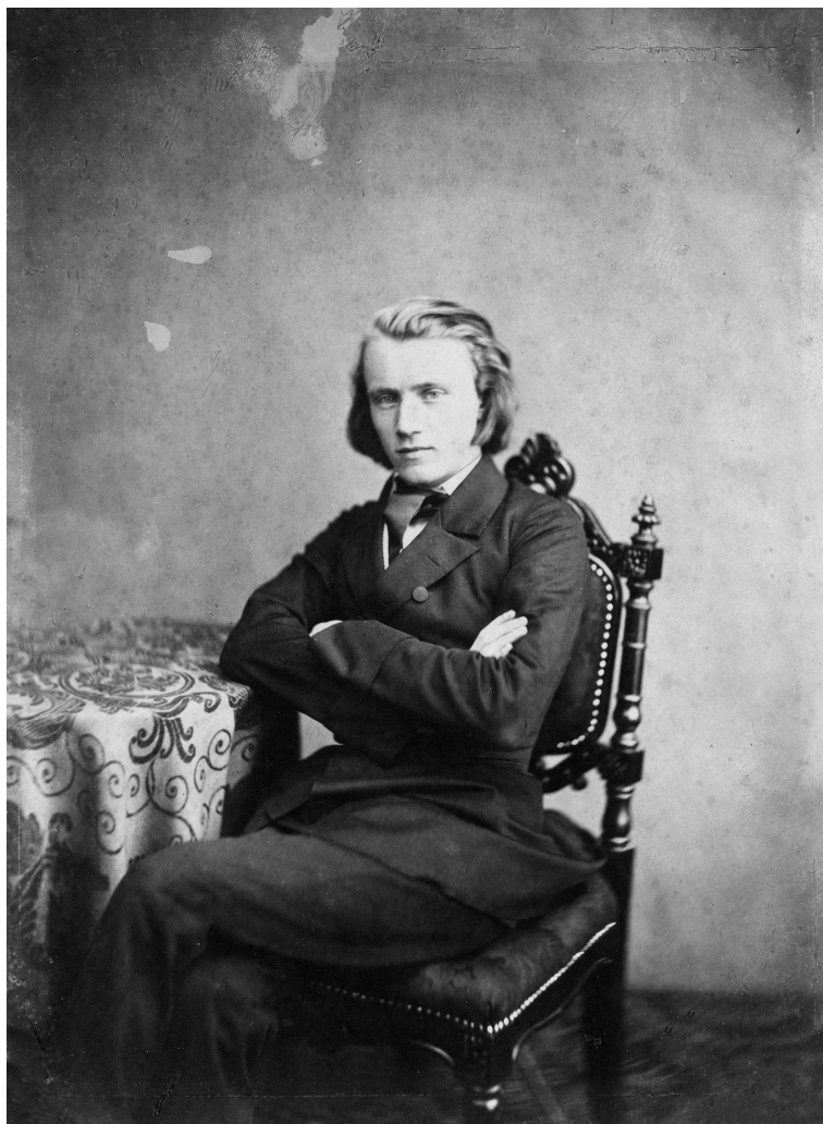
Figure 1.7 Johannes Brahms, c. 1855

a sinner' and – in voices now coming from 'tigers and hyenas' – 'hurling him into hell'. 67 Alternately persecuted by voices of evil one moment, then soothed by those of angels the next, Schumann writes down his last composition, the Geistervariationen , five 'ghost variations' ( Anh. F39) for solo piano, which he dedicates to Clara. With this composition, Schumann has truly become one of the chosen ones, visited by divinities and demons alike, speaking with their authority. And it is this interpretation of his personality that his wife endorses all the way – at least as long as the voices remain angelic, dictating a 'beautifully moving and devout theme' such as that of the Geistervariationen . 68 Through Clara's seeing him to be guided as well as driven by voices that are always nobler or viler than simply human, and never truly his own, Schumann the man – living with but also against