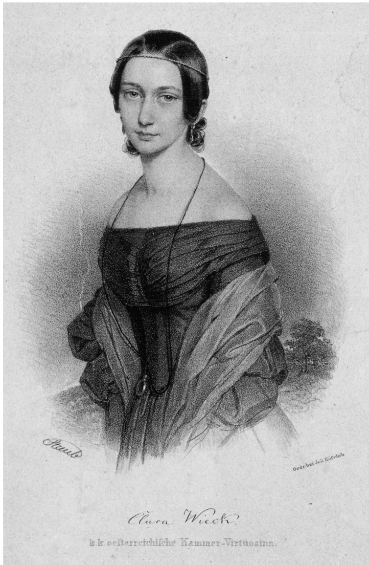
Figure 1.4 Clara Wieck, 1838