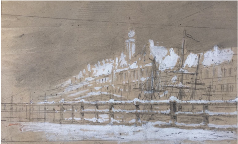
Figure 2. Philippe Chaperon, La princesse jaune set design, dated 1873–4 and 1876. Bibliothèque nationale de France, F-Po MAQ.A.441.

from a snowy Dutch townscape to a Japanese harbour scene (Figures 2 and 3). In this imagining, Kornélis's vision of Japan is just a version of his own hometown rendered 'Oriental' – a harbour being an apt choice for a narrative of encounter. This transition