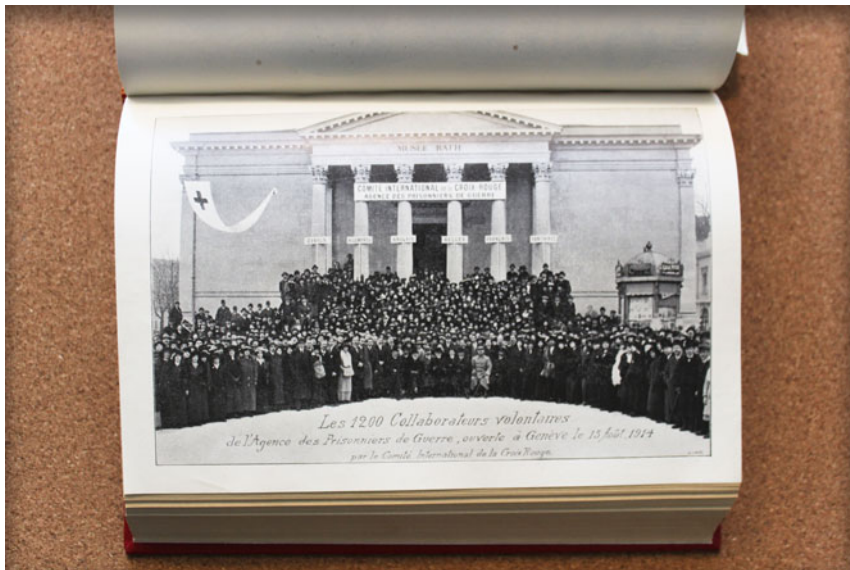
Figure 2. Image of volunteers of the International Prisoners of War Agency in front of the Rath Museum, which was closed from 1916 to 1919 to host the Agency. Bulletin International des Sociétés de la Croix-Rouge , Vol. 46, No. 181, 1915.

activities carried out, and a look at the contents of the Bulletin clearly confirms the extent of these efforts, which were by no means a secondary endeavour. 20