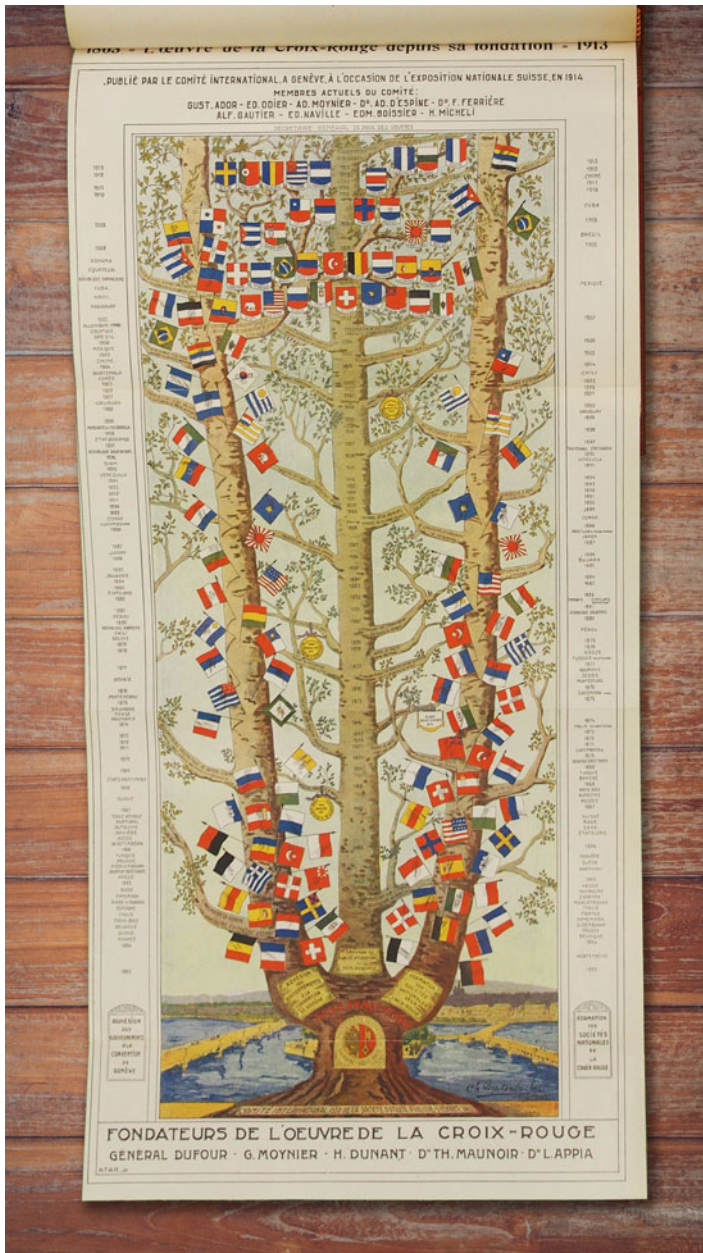
Figure 1. Image published by the ICRC on the occasion of the 1914 Swiss National Exposition. Bulletin International des Sociétés de la Croix-Rouge , Vol. 45, No. 179, 1914.