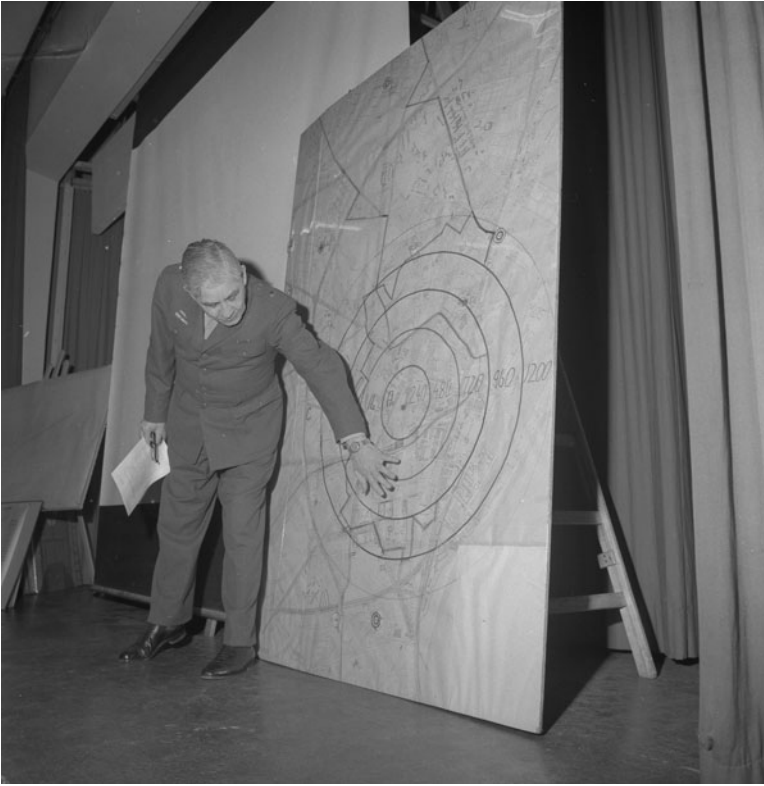
Figure 5. The impact of the bomb is marked with concentric circles and distances in metres from ground zero are noted. Just beyond the 960 metre perimeter, Smith-Hansen points to the CPs marked with small dots.

would take the patient away. Surgical tools would be blocked half an hour for ‘cleaning’. This meticulous process was supposed to make exercise real and authentic. This resulted in a (probably authentic) build-up of patients, and by the end of the exercise seven patients were still waiting for attention, and, we must assume, left to die. Of the 100 patients that were treated, 74 were sent on to hospital and one died on the operating table, 15 were considered to be dying on arrival at the FMAU and three had died during transport from CP.