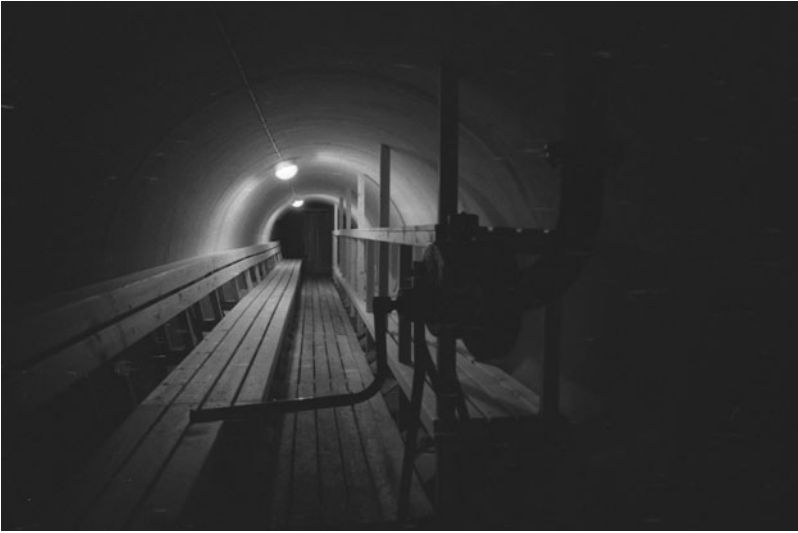
Figure 3. Standard type of public shelter in Aarhus. This one was a ‘showroom model’ built at the civil defence headquarters. It was fitted with benches in the late 1960s.

In 1968–69, there were 22,500 seats in public shelters in Aarhus, corresponding to 19.9 per cent of the population. 39 Aarhus was, hence, one of the few cities in Denmark that came close to meeting the target. This was the result of local activity and agency, especially on the part of two enthusiastic characters: CD Leader Smith-Hansen and Mayor Larsen. 40 During the 1950s, the duo worked determinedly to secure shelter space for their fellow townsmen, with considerable success. Though Larsen’s successor as mayor, Bernhard Jensen, was less convinced of the value of shelters, he continued the course laid out by his predecessor. 41