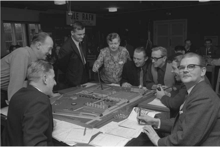
Figure 2. A self-protection unit, most likely from a factory given the building model on the table, receive education at the civil defence headquarters at Kirstinesminde, 25 February 1967.

in case the worst happened. They did not train the citizens to think independently or creatively but to act, to do exactly as the authorities told them to. 34