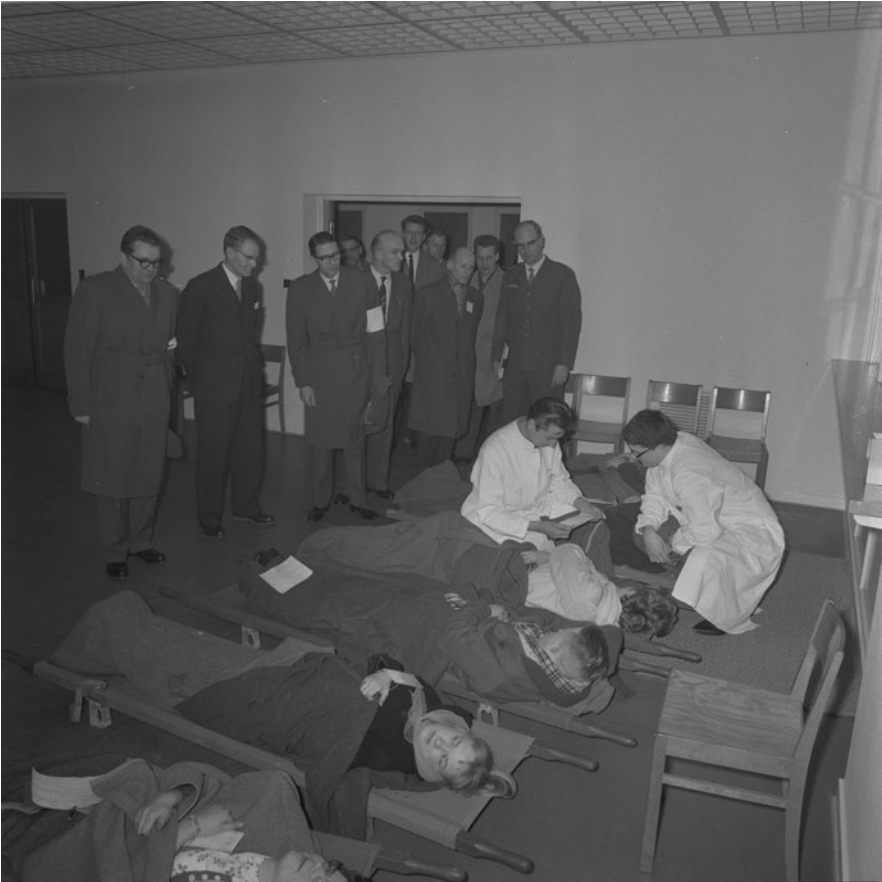
Figure 6. Diagnosing victims of the nuclear attack at FMAU. Guests are observing the progress of the exercise.

2, and an X marked whether that person was in shock, in pain, unconscious or paralysed.