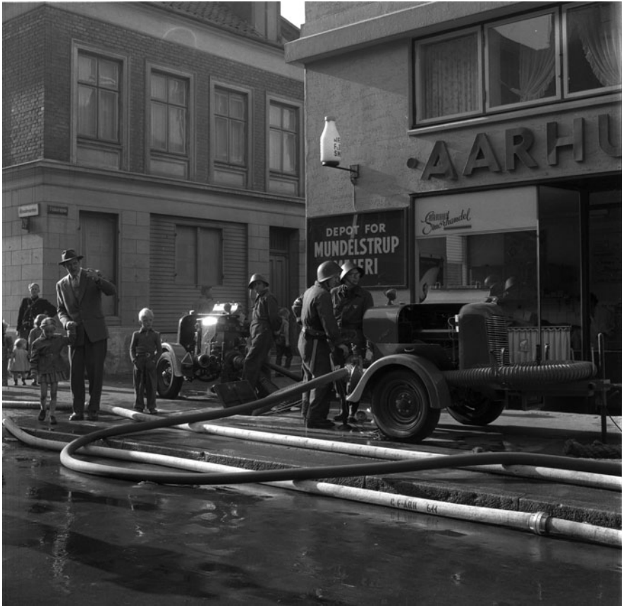
Figure 1. Fire exercise, 30 September 1956. Curious Aarhusians watch as civil defence personnel save a butter dairy.

Aarhus' civil defence plans display an organization that seemed better equipped to meet an upscaled World War II than a nuclear World War III despite claiming to prepare for attacks with (thermo)nuclear weapons. 29