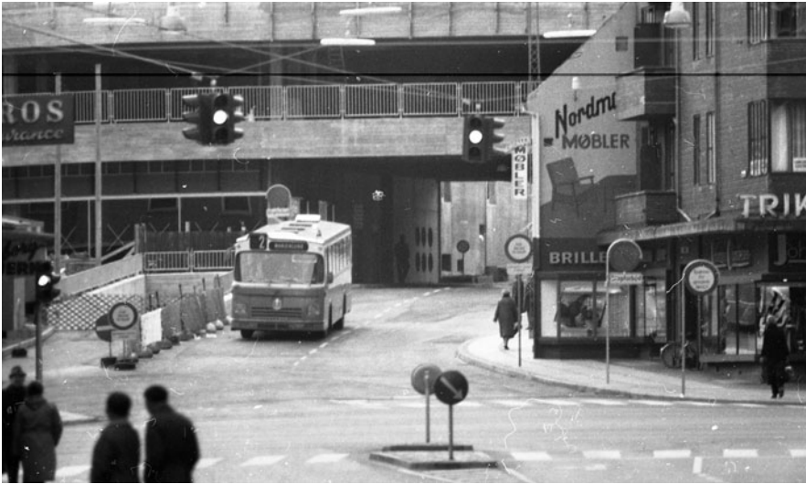
Figure 4. Busgaden in Aarhus in the early 1970s shortly after its inauguration. The entrance to the garage/shelter is under construction and is visible to the left.

make the most of a necessary evil and to take advantage of the obligation to build shelters to boost urban development, yet the nature of this kind of imagineering was not innocent or without consequences. Integrating civil defence built structures into the ordinary cityscape arguably blurred the boundaries between peace and war; it contributed to the normalization of the threat of war by giving that threat a material, yet unobtrusive, presence in the urban life and environment, essentially making it part of the everyday experience. Most likely few Aarhusians dwelled on, or even recognized, the features that revealed the wartime function of their usual parking garage. Neither the dual function shelters nor the ordinary ones were kept secret by the Civil Defence, however, and they were a concrete and inescapable reminder of the threat of war spread all over and weaved into the cityscape.