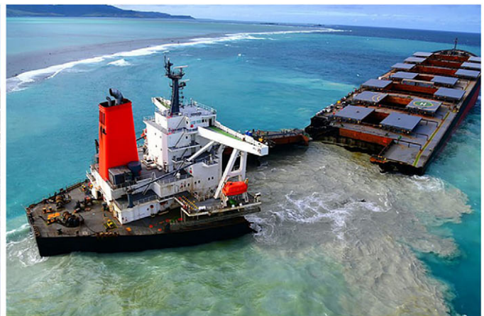
Figure 1. Examples of blue injustice (a) Children playing in front of the coal-fired thermoelectric plant in Quintero-Puchuncaví Bay, which is known as one of Chile’s “sacrifice zones”. (b) Oil spills out of the MV Wakashio after it was run aground on a coral reef in Mauritius on July 25, 2020, resulting in the worst oil spill to date in the Indian Ocean.