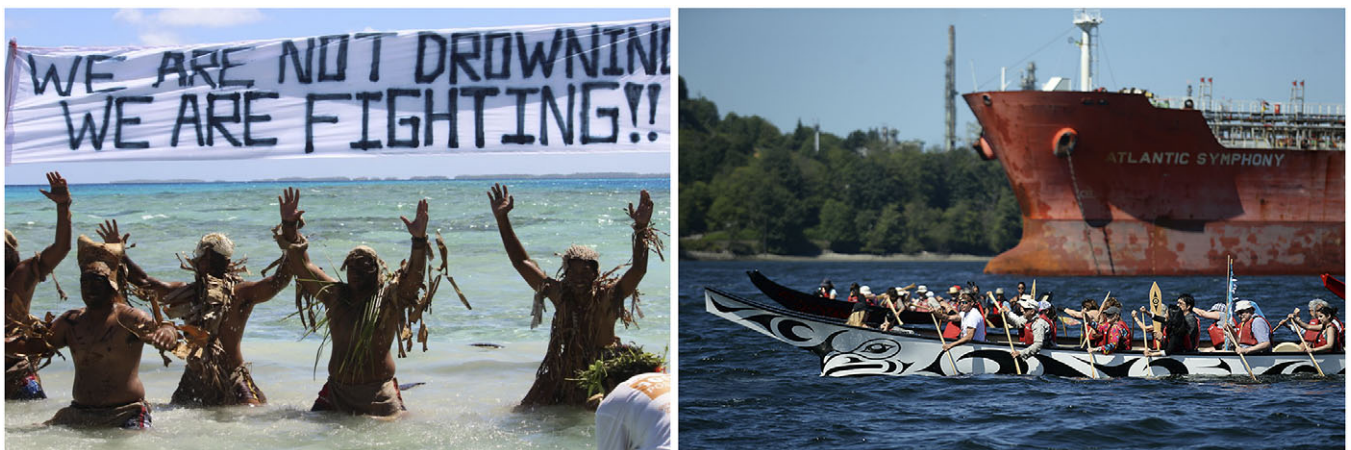
Figure 2. Examples of blue resistance (a) Members of the Pacific Climate Warriors protest climate inaction on the Pacific Warrior Day of Action, March 2, 2013 in Tokelau. (b) Members of the Coast Salish Nations lead a flotilla in protest against the Trans Mountain pipeline expansion in coastal Canada, July 16, 2018.

Coastal Indigenous peoples have effectively engaged in protests in opposition to big oil (Widener, 2018; Figure 2b). For example, on the west coast of Canada, the Northern Gateway pipeline proposal, which was to transport tar sand products from Alberta to coastal British Columbia for subsequent shipping to Asia, was met with widespread protests, many spearheaded by coastal Indigenous