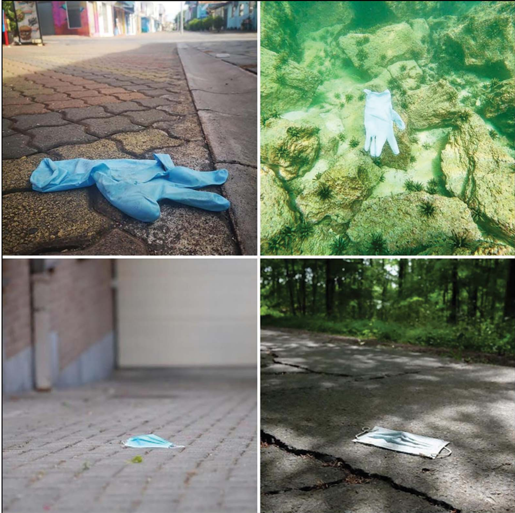
Figure 1. Discarded gloves in Galápagos (above) and discarded facemasks in Brussels (below).