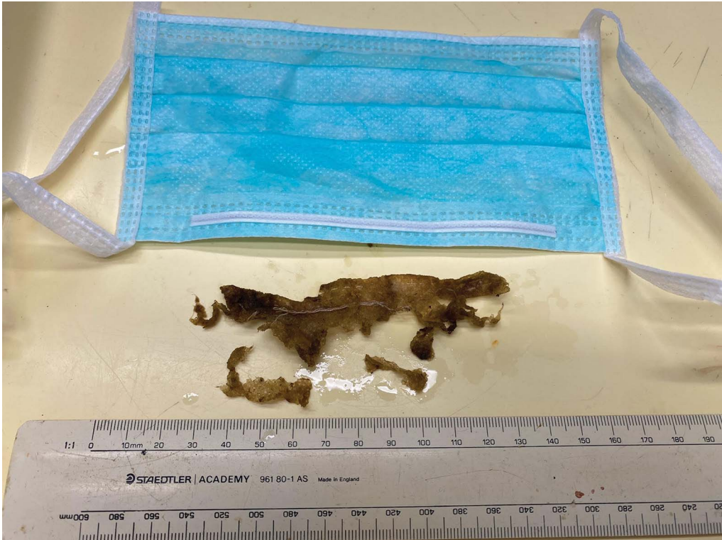
Figure 4. Among the artefacts found within the green sea turtle were the remains of a disposable facemask.

way. Encouraging the use of reusable PPE through incentives, for example, could easily reduce the number of facemasks in the environment (Figures 3–4). Future policies must also encourage governments, industry and communities to work together towards positive behavioural solutions (Vince & Hardesty 2018; Jia et al. 2019). As the case study above demonstrates, social media can be a powerful tool, as it has been shown to influence the political agenda (Barbera et al. 2019).