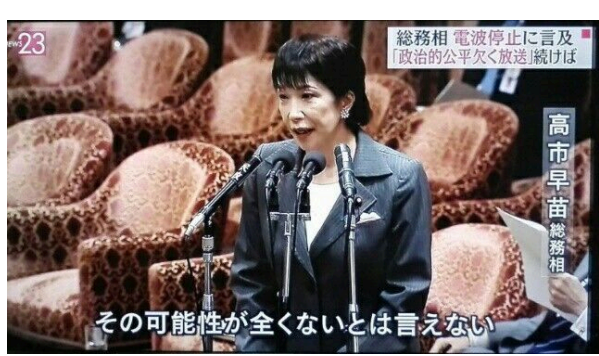
Takaichi Sanae on TBS, 8 February 2016