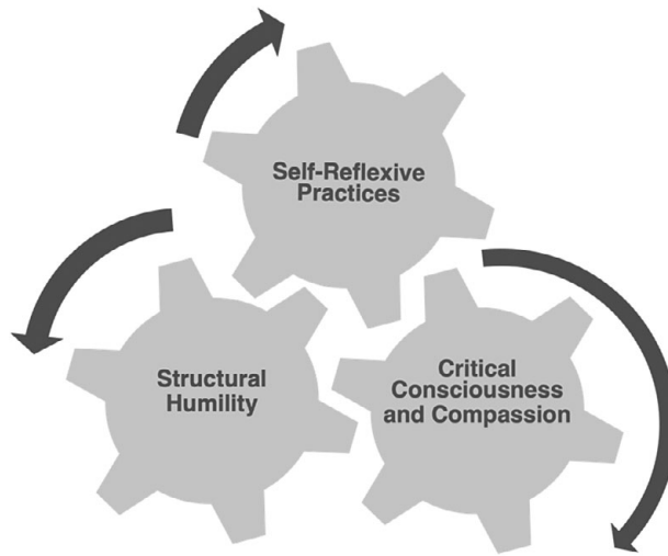
Figure 1. Visual representation of educational framework.

people with severe and persistent mental illness. 61 As recommended in the literature, institutions should incorporate assessments for these phenomena to address structural stigma experienced by MHSUH service users while simultaneously supporting HCPs' wellness. 62 To achieve this, curricula should prioritize fostering a positive relationship with self-reflexive practices, where HCEC learners advance their relational understanding of their surroundings by challenging their own values and assumptions. Once learners transition to professional practice, they will constantly engage in interpersonal interactions that require critical reflective and reflexive practices in hidden curricula. 63 Developing and strengthening this skill while in the theoretical safety of a learning environment allows for continuous and progressive growth. A significant challenge when incorporating MHSUH anti-stigma education into HCEC curricula is determining the degree and nature to which self-reflexive practices should be formalized. Providing learners with dedicated space and time integrated into formal curricula indicates importance and provides tangible opportunities to further develop their reflexive skills. Challenges of implementing self-reflexive practices into formal and informal curricula include determining what constitutes meaningful "reflection" for the purposes of assessment and evaluation.