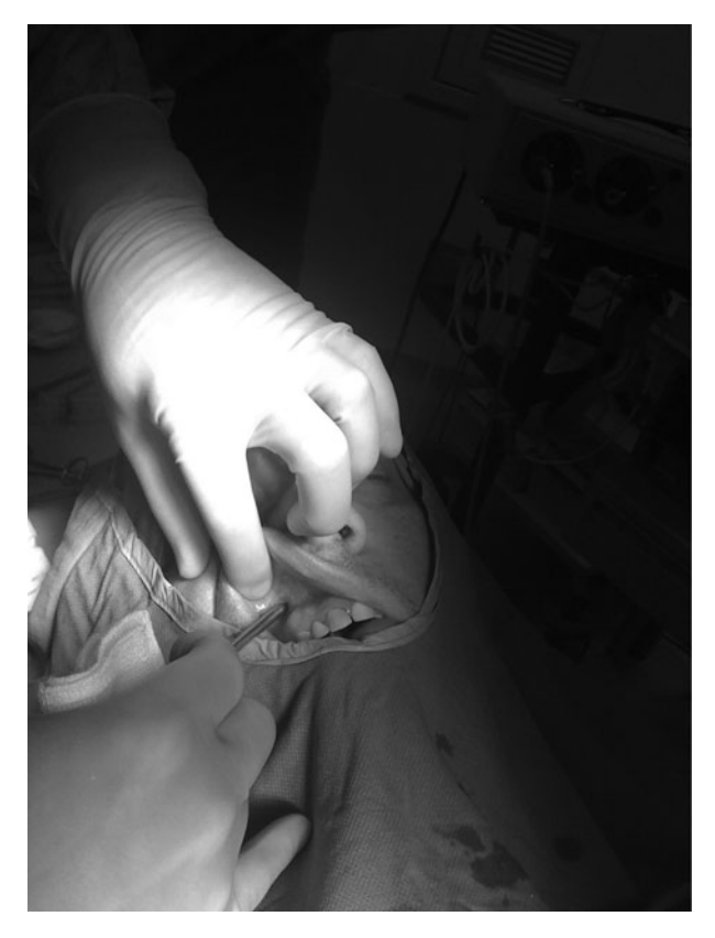
FIG. 1 Operative photograph showing trocar introduced through canine fossa.

30^{\circ} or 70^{\circ} telescope into the nose (Figure 2). This allows a view, through the middle meatal antrostomy, of the tip of the instrument in the maxillary sinus (Figure 3). The surgeon can now deal with pathology in the maxillary sinus. In order to access more awkward areas, such as the