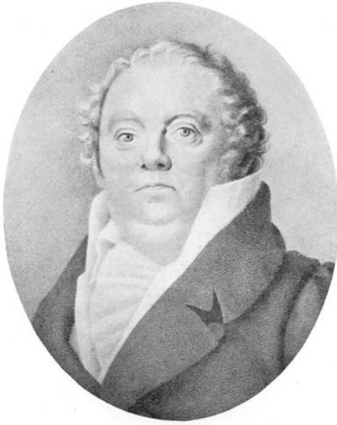
KARL ASMUND RUDOLPHI