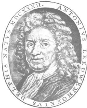
ANTONY VAN LEEUWENHOEK 1632—1725

Separate copies may be obtained from the University Press, Cambridge