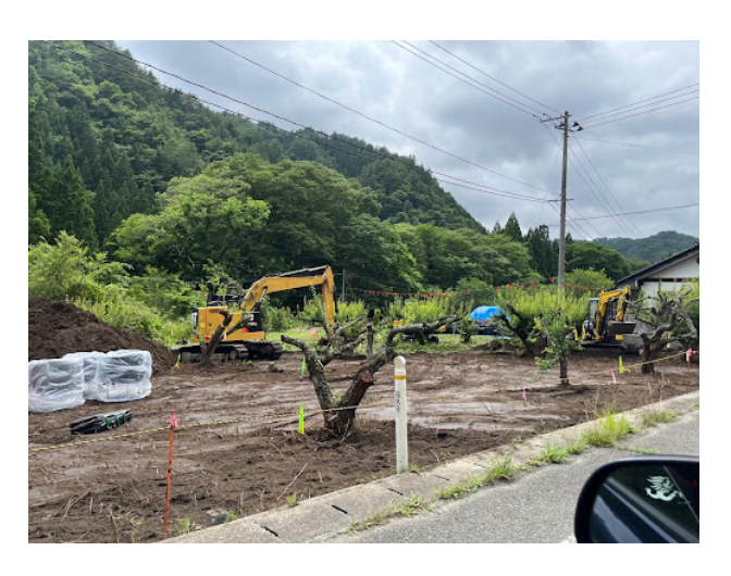
Route 114, Fukushima, 11 July 2022.

Moreover, in lieu of numerous 'Radiation Removal in Progress' fluttering signs in recent years, pink triangular strands of bunting surround condemned front yards and fields that lay fallow, suggesting more that a circus is coming to town than a region in crisis.