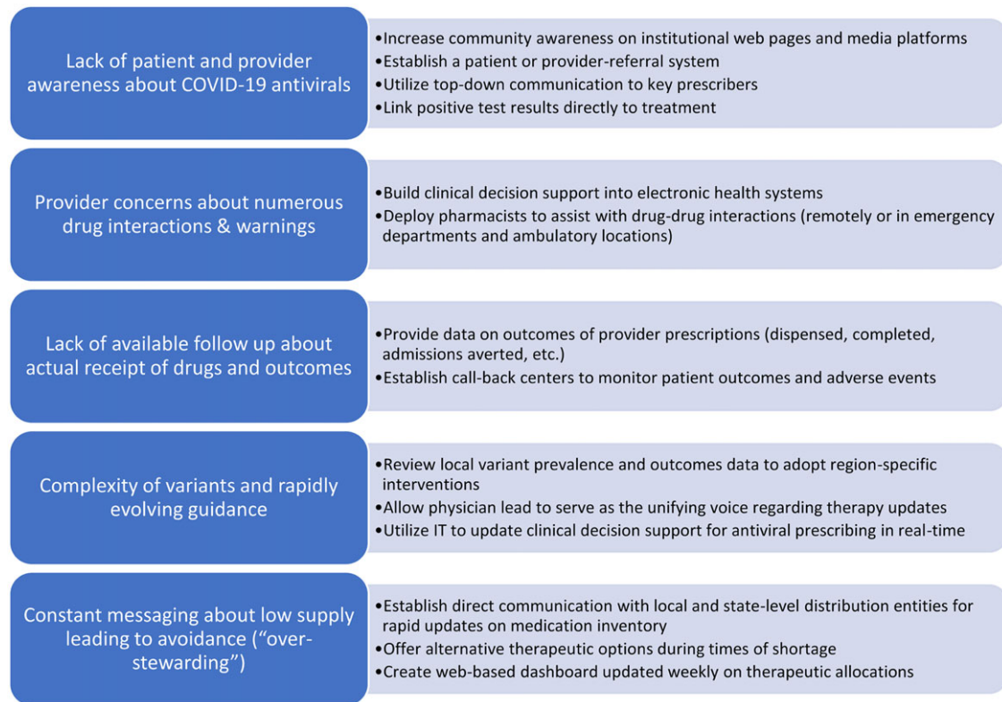
Fig. 1. Recommendations by antimicrobial stewardship programs to overcome barriers to outpatient COVID-19 antiviral prescribing.