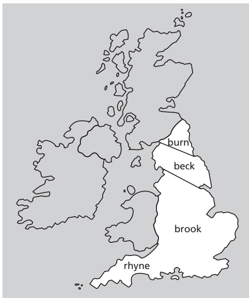
Figure 2 Words for ‘stream’

Once again, a similar distribution was found from the Leeds respondents (Figure 2). With the exception of one respondent, describing herself as coming from ‘north west London’ (who gave her word as wadi , presumably reflecting a South Asian association), the student respondents supplied only beck and brook , congruent with their location. The alumni day respondents added burn , from two respondents further north, and rhine , from two respondents from Somerset. The methodology used with the students did not discourage