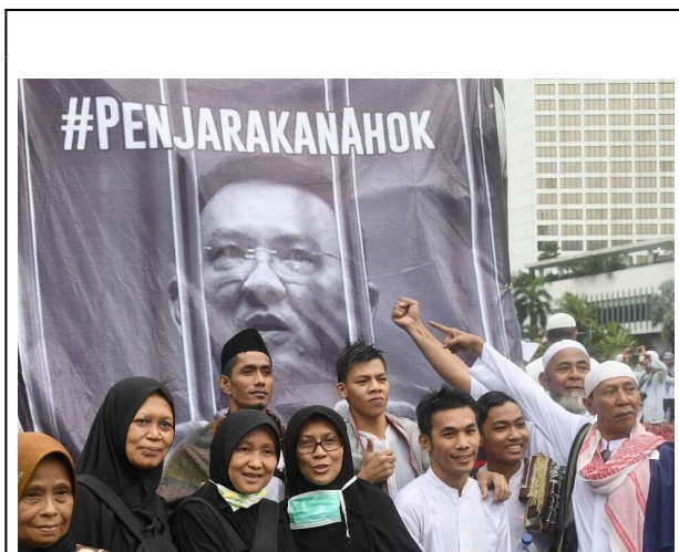
Muslims protest against Jakarta Governor Basuki "Ahok" Tjaha Purnama, who is Chinese Christian in December 2016

one person died in these protests, compared to the thousand killed in the riots preceding Suharto's ouster in 1998. But it was alarming to see hundreds of thousands of Muslims shouting anti-Christian and anti-Chinese slogans, and to see him not only defeated, but convicted on a trumped-up blasphemy charge. (The judges ignored the much more lenient recommendation of Ahok's prosecutors and capitulated to inflamed public opinion.)