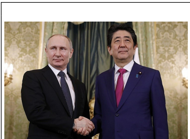
A breakthrough remains unlikely when