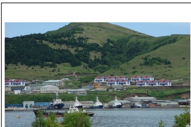
Island of Shikotan, where Russia has established a special economic zone. (Source: www.regnum.ru ).

Russia has therefore shown little inclination to compromise on the most important legal question. Instead, Russian politicians have sought to encourage Japan to invest under Russian law, warning that, if Japan does not proceed quickly, Russia will solicit investment from other countries (Podobedova 2018). This threat appeared to be carried out when, in March 2018, Sakhalin Governor Kozhemyako announced that an unnamed U.S. firm had agreed to invest in a diesel power plant on the island of Shikotan (News24.jp 2018). The Russian side also appears eager to press forward with the details of the joint economic projects, thereby making it harder for the Japanese side to walk away if their legal demands are not met.