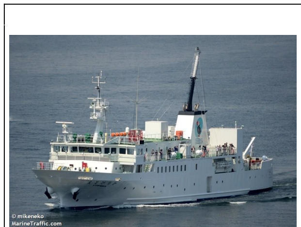
The Etopirika, which is used for visa-free visits to and from the Southern Kurils/Northern Territories.

the former residents and their relatives to visit the islands. The existing system, which has operated since 1992, enables relevant Japanese citizens to visit the islands without the need of a visa, which would acknowledge Russian authority. To make the system reciprocal, Russians now living on the islands are permitted to visit Japan under the same conditions. These annual summer visits are conducted using the Etopirika, a Japanese passenger ship that is based at Nemuro, the closest Hokkaidō port to the disputed islands. These trips can be very time-consuming, not least because it has been the practice for all entry procedures to be conducted at sea at a point near Kunashir/i. This means that, even when traveling to one of the other islands, all visitors must go by way of Kunashir/i, in some cases adding six hours to the journey time (TASS 2017). Additionally, even during the summer months, the weather conditions and visibility in the area can often be poor. These factors mean that it is increasingly difficult for former residents, whose average age is over 80, to make the trip.