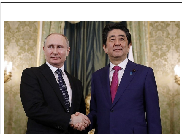
A breakthrough remains unlikely when

It is impossible to entirely rule out a surprise outcome at the May summit. In particular, the Russian side may judge it expedient to permit Japan to make some gains. This would give Abe something to sell domestically, thereby raising the chances of his pro-Russian policy continuing. However, given the legal obstacles and the fact that Abe is unlikely to agree to an extensive visa-free zone, the most likely result is a summit that delivers little beyond a few symbolic images, some vague economic promises, and an agreement to continue working on the joint economic activities. This is an outcome that is largely satisfactory to the Russian side since they remain in control of the islands and they gain a certain international legitimization by Abe's diplomatic efforts. By drawing out the dispute for as long as possible, the Russian leadership also ensures that Japan will continue to have reasons to court Russia through promises of economic cooperation and by distancing itself from Western policy designed to isolate Russia. This lack of urgency can be observed in the comments of Deputy Foreign Minister Igor Morgulov who stated at the start of May that "Real progress in resolving this issue is possible in the context of the comprehensive development of Russia-Japan ties, and the formation of an atmosphere of genuine mutual trust and partnership. We are only at the very beginning of this process." ( Izvestiya 2018).