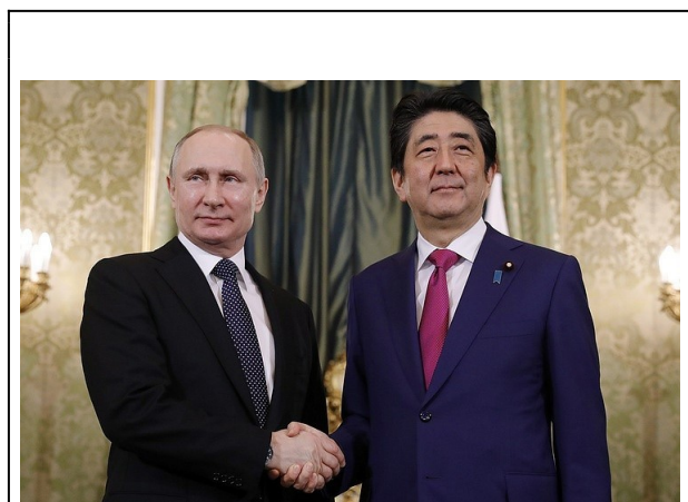
A breakthrough remains unlikely when