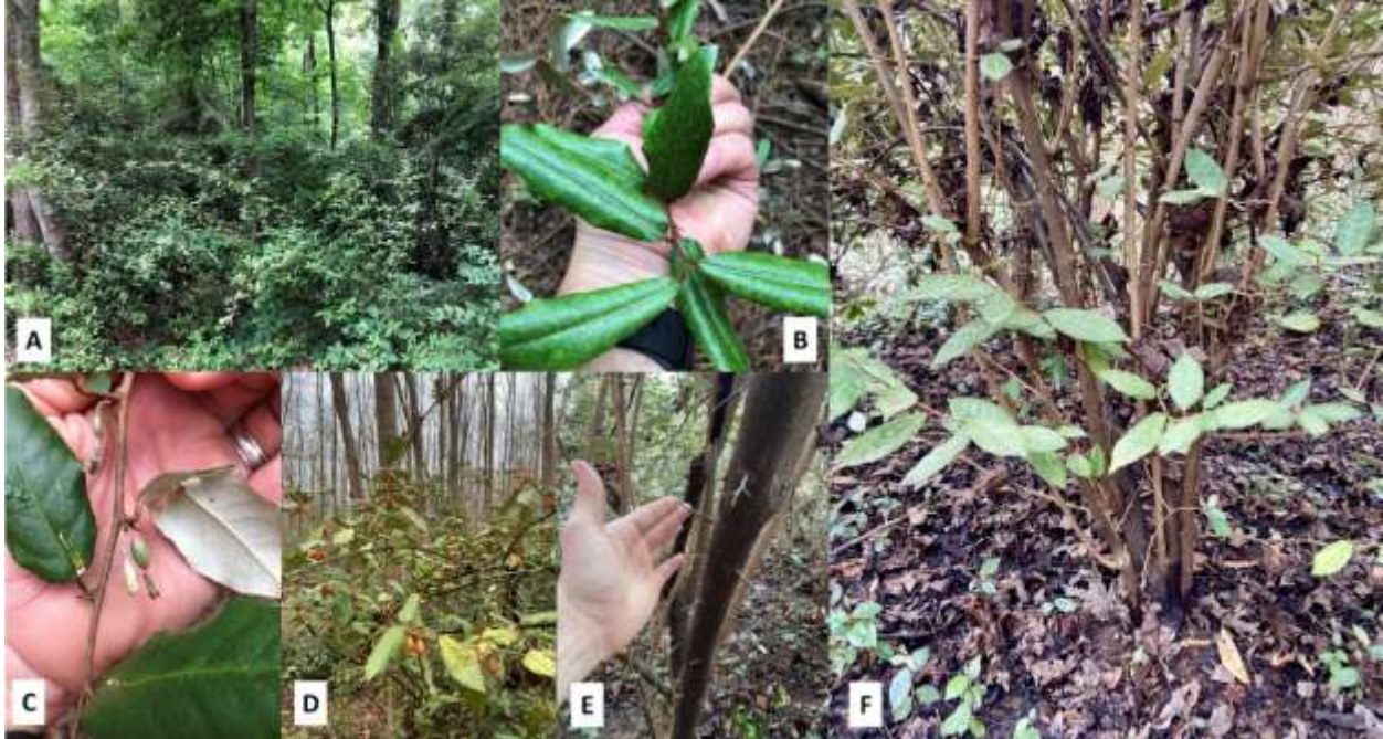
Figure 1. Characteristics of Elaeagnus pungens in Calhoun Co., South Carolina, United States: (A) dense, sprawling growth; (B) leaf surface is dark green and waxy; (C) leaf undersides are silver and reflective; (D) fruit are red drupes; (E) thorns 2.5 to 5 cm in length grow on branches; (F) growth is multi-stemmed and freely branched. Photos A, D, E, and F by M.N. Darr; photos B and C by D.R. Coyle.