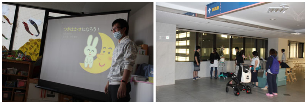
Figure 1. Scenes of our activities in Kyoto University Hospital. Left: storytelling in the afternoon session. The theme of this talk was about moon at this time, as this was in autumn and a time for moon watching. Right: gazing the moon and stars from inside the hospital.

inside of the building. With small telescopes, we mainly watch the moon and sometimes the planets (right panel of Figure 1). Another popular content for the evening session is universe travel using MITAKA, which is a universe-visualizing software developed by NAOJ §.