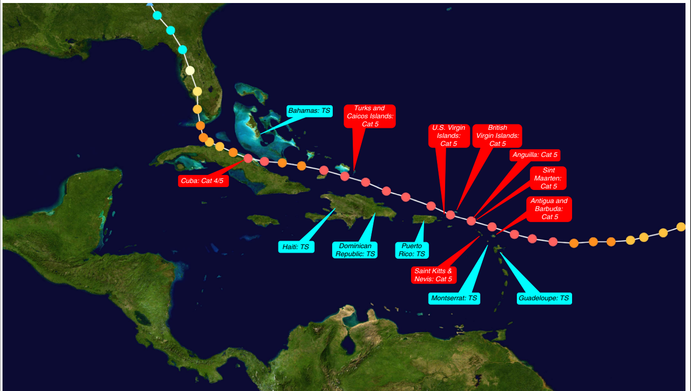
2017 Atlantic Hurricane Season: Hurricane Irma Impacts on 14 Caribbean Region SIDS