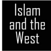
ISLAM AND THE WEST