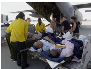
New Orleans, LA, September 3, 2005. Rescue crews help survivors of Hurricane Katrina.