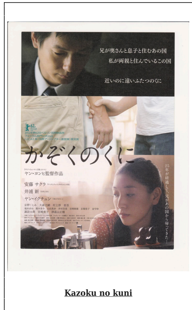
Kazoku no kuni

first-generation Zainichi in Osaka, and her brothers’ decision to emigrate to North Korea, and about Yang’s niece, a young daughter of one of the brothers who had emigrated to North Korea. Both accounts attempt to depict the full dimension of Zainichi and Zainichi-turned-North Korean lives, replete with humor and warmth often lacking in other accounts. Above all, without being blind to the larger context of Zainichi lives, the documentaries depict them as multidimensional human beings.