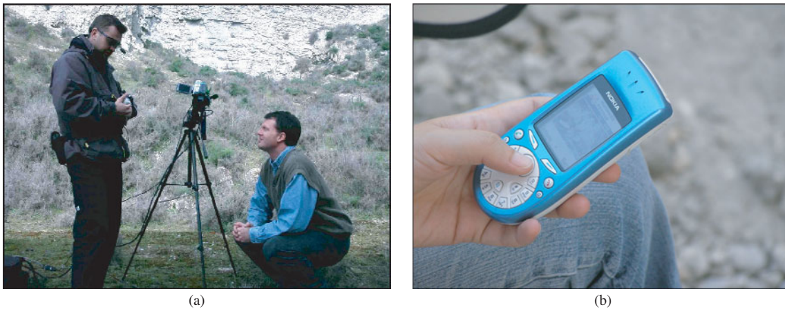
Fig. 1. Comparison of the equipment required (a) when using a wearable computer and (b) when using a camera phone.

Although the quality of the cheaper camera-phone models cannot be compared with that of professional digital cameras, improvements in mobile-phone technologies are introducing significant improvements in the imaging capabilities of camera phones. In fact, the most recent camera phone models, such as Nokia's E90, boast a 3.2 megapixel resolution with flash and autofocus features. This means that the image quality of camera phones may soon be comparable with that of digital cameras. The considerable reduction in the equipment required during field-testing makes it easier for users to complete a remote field-testing of the computer-vision exploration system. Within this problem domain, the fruits of this project could be adapted to serve as the computer-vision system for the microbot swarm for planetary surface and subsurface exploration, as envisioned by Dubowsky et al. (2005), or the lowest tier sensor-web of a multi-tier exploration system, as envisioned by Fink et al. (2005). Furthermore, such a camera-phone system could readily be adapted for a number of other applications or exploration algorithms beyond the application and algorithm that we have developed and tested.