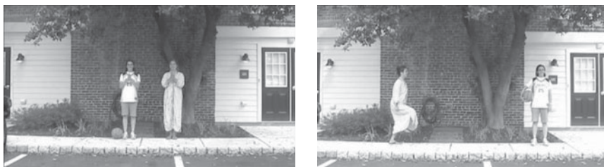
Fig. 2. Movies depicting approach and intransitive events were combined with different voiceovers to create either approach trials or intransitive trials. For instance, in an approach trial using the two movies shown above, participants would hear The princess the basketball player pookos , with the target movie to the right. In an intransitive trial they would hear The basketball player and the princess are zorping , with the target movie to the left.

required participants to listen to a voiceover sentence, then pick which of two simultaneously played movies depicted its meaning. The characteristics of the different trial types are described in more detail below.