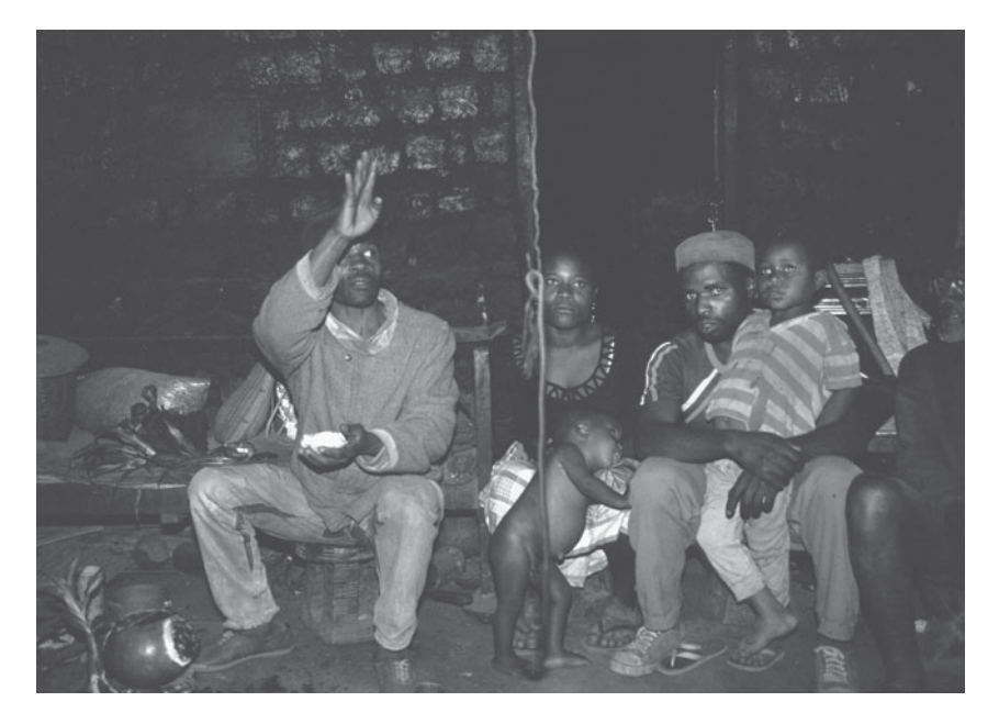
FIGURE 3 The healer throws little balls of njimte into all four corners of the room, onto the ground near the calabashes and into the fire

The healer pours wine on the doorstep, praying as he does so, then adds more to the calabash. The healer then throws little balls of a ritual mixture of cocoyam, palm oil and ground pumpkin seeds known as njimte into all four corners of the room, onto the ground near the calabashes and into the fire. At this stage, the fiar' k\partial \gamma en is lit. The healer then paints stripes onto the door lintel; three sets of three: these are known as the ciphers of the calabash ( eniar' k\partial \gamma en ). Two snail shells are then placed in the calabash and 'read' by the healer according to how they float there. The mother, the child and others present then come to pour wine into the calabash and drink from it.