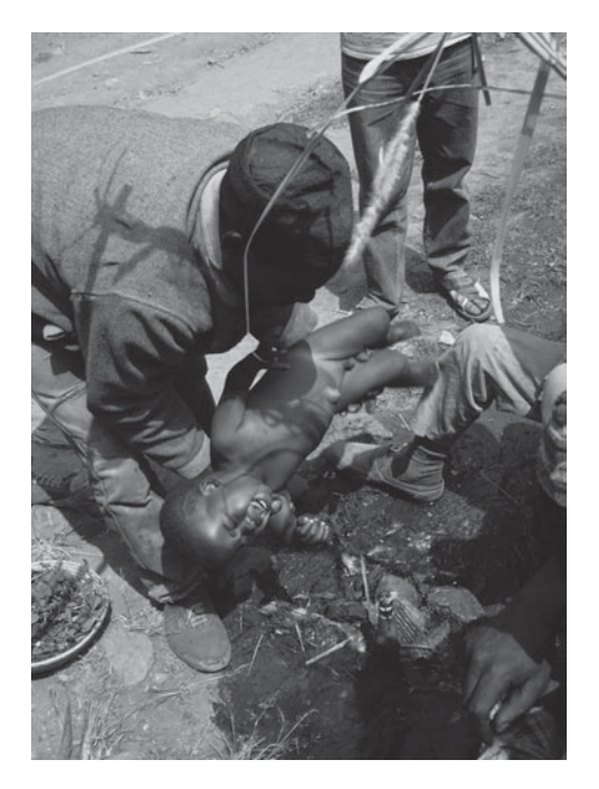
FIGURE 4 A woman's planting knife with a lump of incense atop its handle is planted in the water under the arch. As it burns in the water the healer swings the child around the knife handle

a locally smithed hoe are placed under the spear and elephant stalk arch, between the two holes. The healer utters a prayer and blows the horn again at this point. The extremities of the live fowl (wings, feet and beak) are passed across the water in the holes, then across the lips of the mother and child. The healer performs divination with the two flower buds again. While all present hold the assistant's arm, he kills the fowl bloodlessly by compressing its chest against the ground. Down-feathers are then plucked from it and put on the place along with \eta k \varepsilon \eta leaves (Dracaena sp.). The healer and then the others sprinkle camwood on the place.