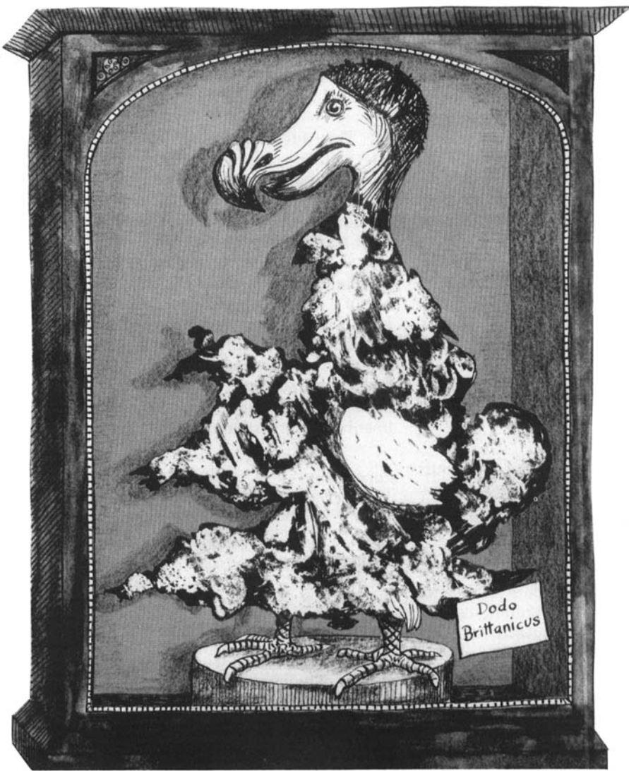
Dodo Britannicus by Chris Orr, cover illustration to Robert Hewison's book, The heritage industry .

Oxford Archaeological Unit; ISBN 0-904220-09-5 paperback), £2.95, or £3.25 by post: Oxford Archaeological Unit, 46 Hythe Bridge Street, Oxford OX1 2EP.