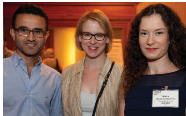
Many international participants enjoyed the International Attendees Reception and reconnected with colleagues.