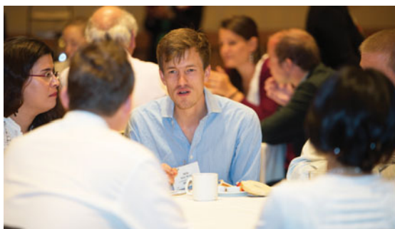
The New Members Breakfasts (photos left and right) provided opportunities for informal exchange of information about the association and professional discussion.