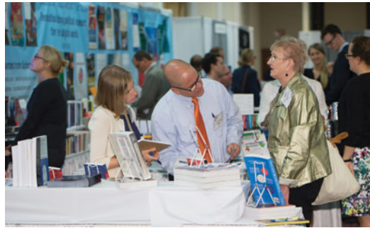
The exhibition hall, left, featured publishers, news agencies, universities, and many other types of organizations of interest to the attendees.