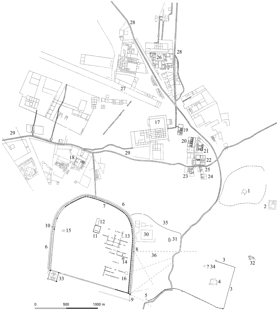
Map: German Archaeological Institute/Jena University

1) Dair al-Zakkā. 2) Roman-Byz. Square Building. 3) Walls of Kallinikos/al-Raḡḡa. 4) Congregational Mosque of al-Raḡḡa. 5) Mausoleum of Uwais al-Qaranī. 6) Walls of al-Rāfiqa. 7) North Gate. 8) East Gate or Bāb al-Sibāl. 9) Bāb Baghdad. 10) West Gate. 11) Congregational Mosque of al-Rāfiqa. 12) Cistern. 13) Street Grid. 14) Qaṣr al-Banāt. 15) So-called 'Church'. 16) Square Complex. 17) Main Palace of Hārūn al-Rashīd. 18) Palace A. 19) Palace B. 20) Palace C. 21) Palace D. 22) North Complex. 23) Western Palace. 24) Eastern Palace. 25) East Complex. 26) Northeast Complex. 27) Hippodrom. 28) North Canals. 29) West Canal/Nahr al-Nīl. 30) Sāmarrā'-Period Complex. 31) Tall Zujāj/Glass Tell. 32) Tall Aswad. 33) Ayyūbid Citadel. 34) Mausoleum of Yaḥyā al-Gharīb. 35) Wall of Ṭāhir ibn al-Ḥusain. 36) Main Street of al-Raḡḡa al-Muḥtariqa.