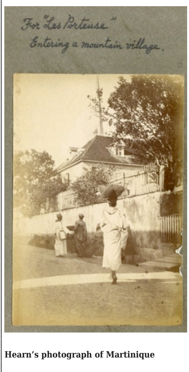
Hearn's photograph of Martinique

Had he lived another two or three decades, he would have been appalled at the manner in which the self-aggrandizing powerbrokers in the cultural establishment of Japan used him for the purposes of justifying incursions into Asia. He loathed the modern Japanese male and what he stood for, and in this he recognized the futility of his task, a futility keenly felt toward the end of his years, where he heard “nothing but soldiers and the noise of bugles.”