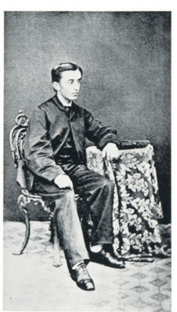
Hearn at 16

But it was with just such a family that Hearn found himself fettered late in his life. This Poe-faced outsider and aficionado of the eerie and the bizarre, who any number of times had been bereft of the barest means of subsistence, living off the smell of an oily rag in London, sleeping rough and wandering the streets of the Rue Morgue in Cincinnati and New Orleans, was to be earning a formidable salary as a teacher in Japan while supporting up to 11 people, including wife, four children, in-laws and servants. He published on average a book for every year he lived in Japan and was read eagerly not only by Americans for his esoteric insights into Japanese mores, traditions and passing lifestyle, but also by readers in China, India and Europe, though not Japan.