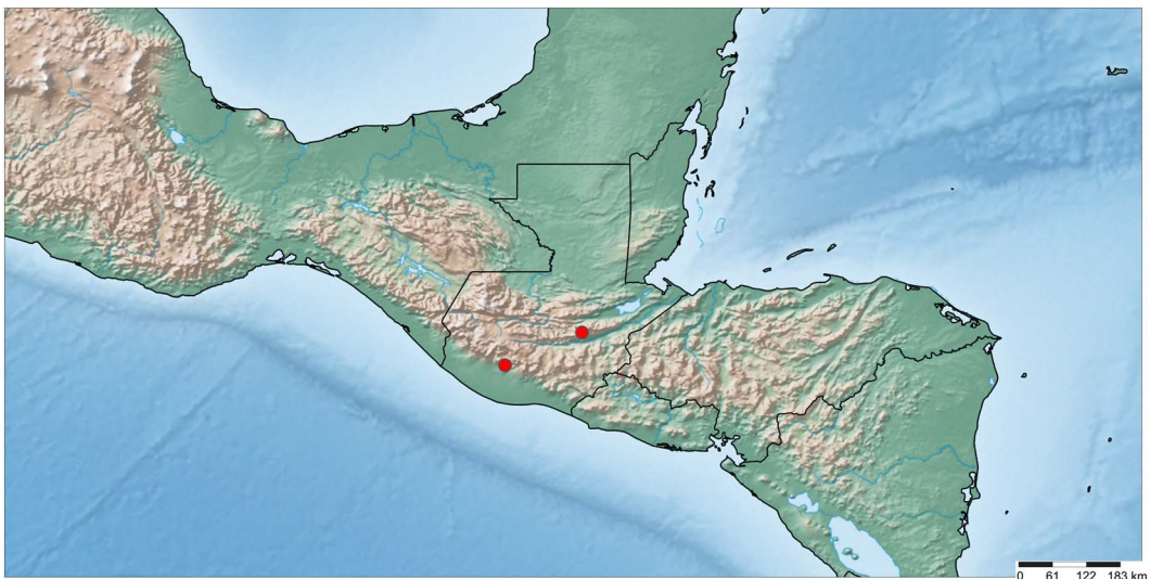
Fig. 18. Known distribution of Onthophagus contrapositus new species.

punctures on anterior declivous portion, remainder of the surface with moderate coarse umbilicate punctures separated by 1–3 diameters; anterior edge of pronotum slightly upturned medially; with large median conical horn extending over the head, apex of horn flattened dorsoventrally, forming two laterally oriented tubercles, ventral surface of horn lacking longitudinal carina, slightly longitudinally concave; pronotal surface near anterior lateral angles deeply concave; posterior marginal bead only present medially. Elytra (Fig. 1). Elytral surface glossy between punctures, puncture of intervals weakly defined and slightly irregular in shape, not umbilicate, lacking setae and separated by 1–3 diameters; Elytral striae deeply impressed, strial punctures separated by 1–2 diameters, encroaching on intervals. Pygidium . Surface with confluent coarse umbilicate punctures throughout, surface