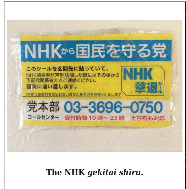
The NHK gekitai shiru .

whiteboard, he explained why his party promoted the “destruction” of Japan’s national public broadcaster, NHK ( Nippon hōsō kyōkai ), and how he intended to protect the Japanese people from what he called the “viciousness” of NHK license fee collectors.