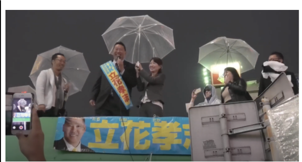
The view of the election car from the Seikei Yukkuri stream.

Because N-Koku streams are typically amateur, they commonly cut out, often at critical moments, and Ikebukuro was no exception. The chat section that appears on the side of each YouTube livestream was filled with cries of “ kuru kuru ” (‘spinning’), a reference to the symbol that YouTube uses to indicate that a video or stream is buffering. The patchy reception that plagued the stream eventually gave way to a complete termination of its signal, and viewers came to be collectively stuck on a stopped frame that indicated buffering. Using YouTube’s search function to find an alternative stream, I traveled to a channel I had never seen before, that of Hiratsuka Masayuki 19 , which was listed at the top of the search results.