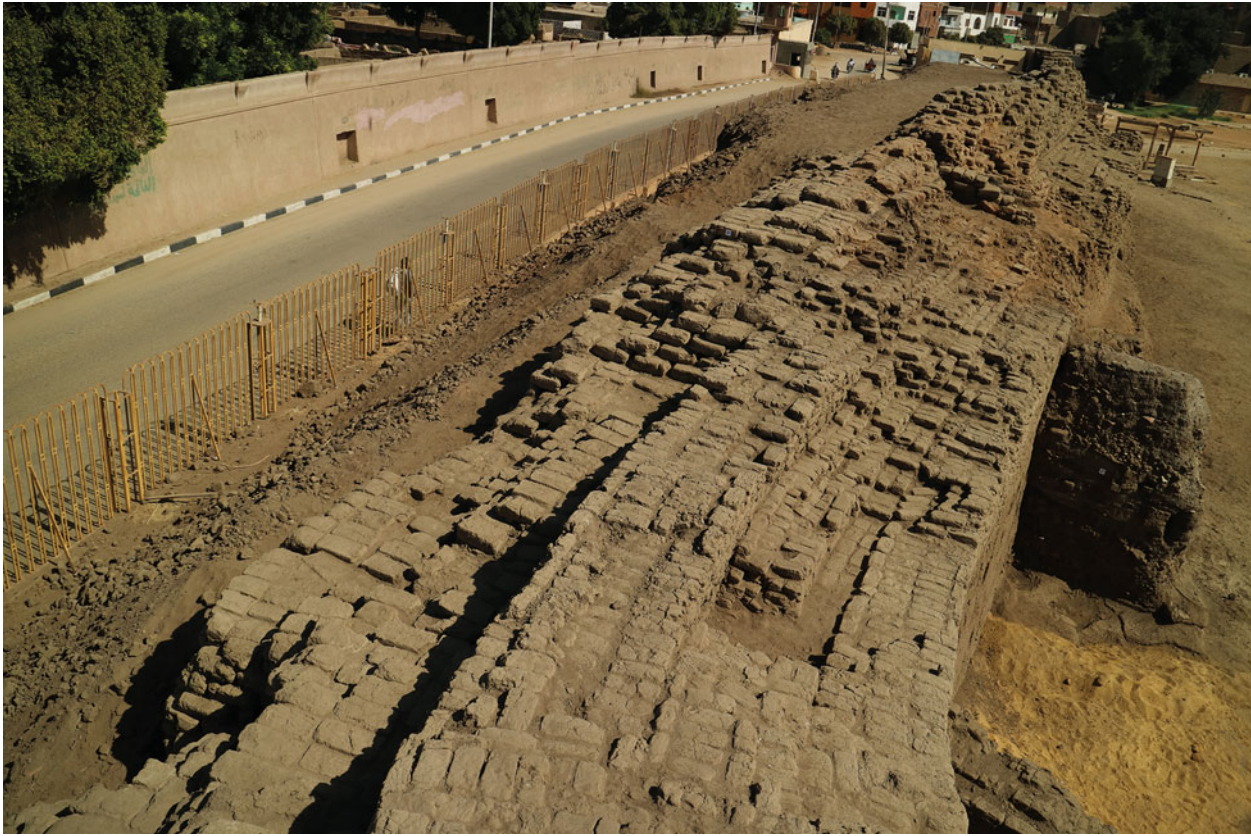
Figure 3. Section showing a series of late Old Kingdom and Middle Kingdom town walls at Edfu. Note the layers of accretion walls showing multiple renovations over time.

territorial state of Egypt itself, 12 albeit one conceptualized in rather different terms than modern states (Siegel 2022). Urban centres in Pharaonic Egypt generally lacked public squares or plazas (Moreno Garcia & Feinman 2022, 71), so monumental walls and gate complexes were ideal settings for awe-inspiring spectacles or conspicuous display, as evidenced by temple pylons, 13 elaborate enclosure walls surrounding royal funerary complexes, 14 and the so-called palace façade-style architecture (Emery 2018). It must be emphasized, of course, that monumental walls are just a single, rather blunt instrument (used in tandem with countless other methods) through which commanding authorities attempted to actualize and fix such social totalities in Pharaonic Egypt, though they were one that was particularly conspicuous in the lived experience of the ancient Egyptians themselves and remain so in the surviving archaeological record.