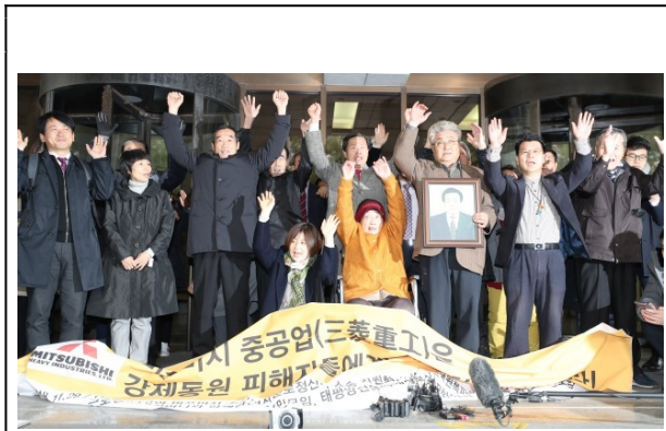
The South Korean Supreme Court upheld the verdict requiring Mitsubishi Heavy Industries to compensate Korean forced laborers