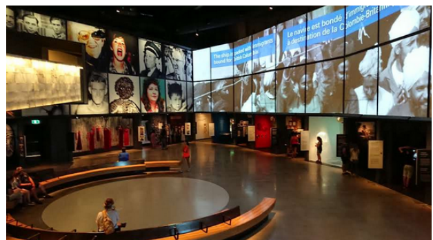
The “Canadian Journeys” gallery of the Canadian Museum for Human Rights

This museum in no way presents Canada as an innocent nation. The “Canadian Journeys,” the largest gallery of the museum presents dozens of Canadian stories of human rights violations, from those of the Aboriginal Peoples (First Nations, Métis, and Inuit), notably the Indian Residential Schools, to those of women, sexual minorities, physically challenged, and racial minorities such as the Head Tax imposition on Chinese Canadians and the war-time incarceration of Japanese Canadians.