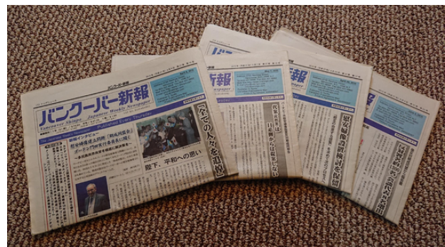
Examples of Vancouver Shinpo running front-page articles on the opposition movement against the Comfort Women statue.