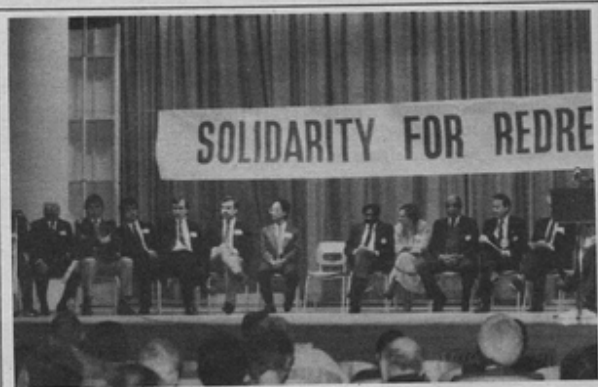
NATIONAL ETHNIC LEADERS gathered together on the stage of Harbord Collegiate auditorium to show solidarity for the Japanese Canadian redress movement.

TORONTO — Under the banner “Solidarity For Redress”, leaders of twenty-one national ethnic organizations united in a display of support for Japanese Canadians at a rally held on October 29 at Harbord Collegiate Institute in Toronto.