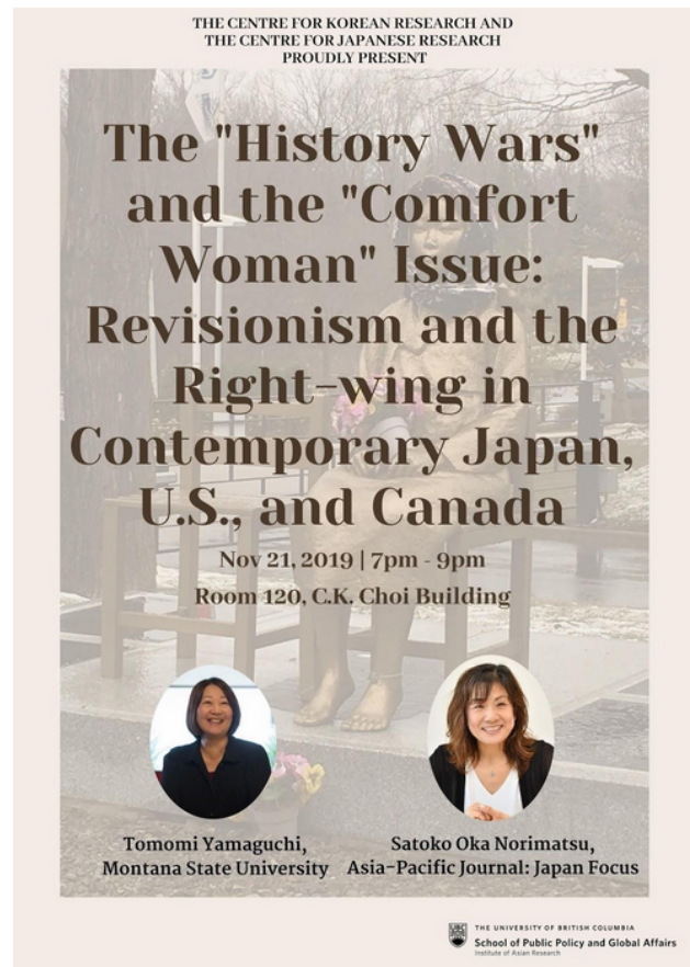
Event poster by the Centre for Korean Research and the Centre for Japanese Research, University of British Columbia