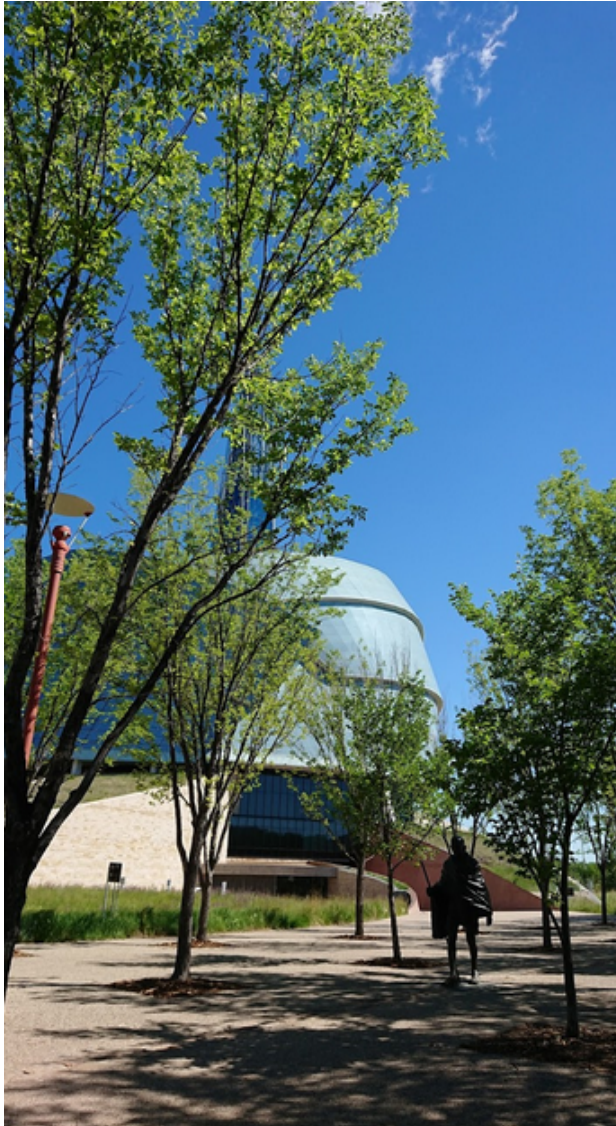
The Canadian Museum for Human Rights in Winnipeg.

At the Canadian Museum for Human Rights in Winnipeg, 38 we can study human rights violations in and outside Canada, including the five genocides outside of Canada that have been recognized by the Canadian parliament: Armenian Genocide (1915), Ukrainian Holodomor (1932-33), Nazi Holocaust (1933-45), Rwandan Genocide (1994), and Srebrenica Genocide in Bosnia (1995). The “Breaking the Silence” section that exhibits those histories of genocide states,