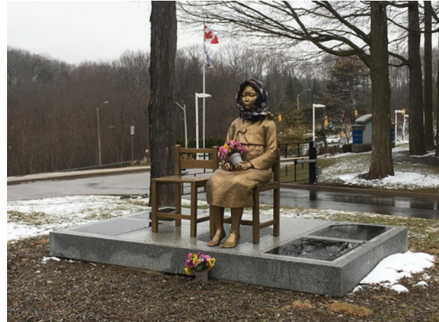
Statue at the Korean Canadian Cultural Association in Toronto, Ontario.

The Toronto statue was the first Comfort Women statue erected in Canada, and the 3rd in the world outside of Korea, after Glendale, California (July 2013) and Southfield, Michigan (August, 2014). While the Glendale statue was built in a public park, the Southfield statue was built on private property, as the effort to find a public location for it was thwarted by the Japanese government and corporations.