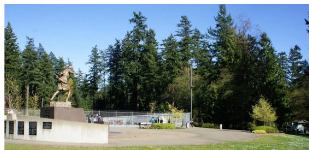
The Korean War Memorial at Central Park, Burnaby.

The planned site for the "Comfort Women Statue" for Burnaby, BC was on the western