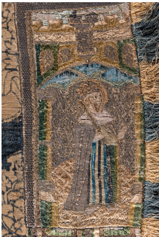
Fig 9. The St Petrock pall at Exeter Cathedral is made up of velvet and embroidery from vestments possibly dating from the fifteenth century. The detail shows embroidery of a figure standing on tiled floor.