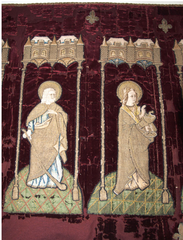
Fig 11. The Apostles cloth at Cotehele. The detail shows Saints James the Lesser and John the Evangelist standing on mounds of applied silk textile and without the characteristic embroidered background filling.