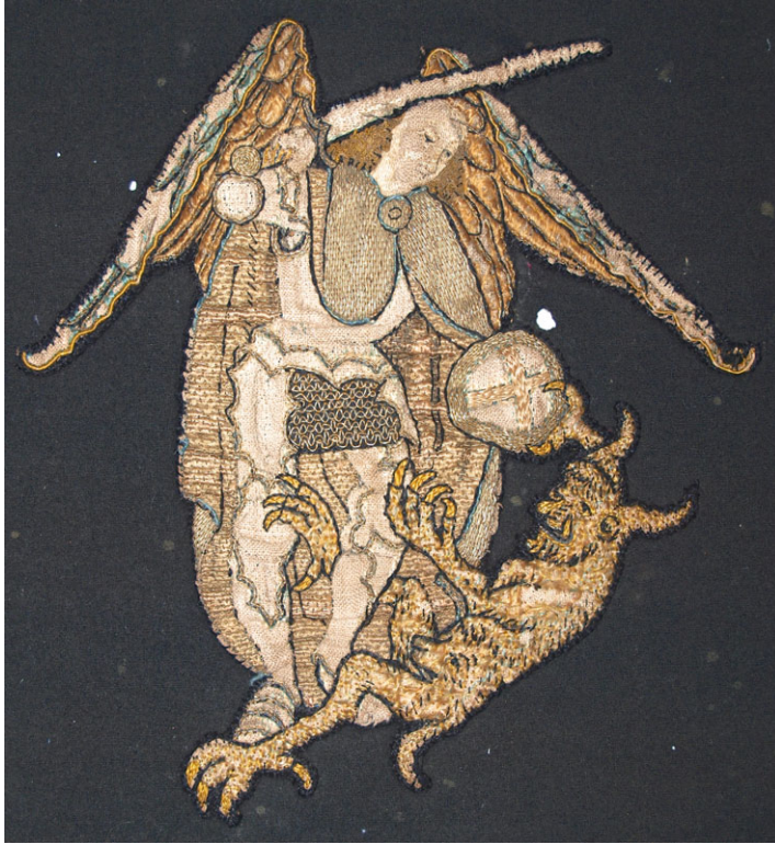
Fig 2. The mourning cloth at Cotehele. Embroideries dating from the late fifteenth/early sixteenth centuries have been applied to wool cloth in the early nineteenth century. The detail shows Archangel Michael overcoming Satan.