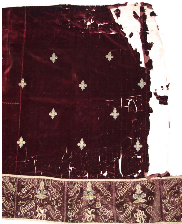
Fig 12. The motto cloth at Cotehele. The upper velvet is powdered with applied fleur-de-lis motifs, while the lower band shows embroidered monograms and mottos on earlier velvet. Detail of the proper left section.

In contrast to the upper panel, the lower band presents a very different quality of velvet, while the style of needlework varies greatly from that on the cloths already discussed.