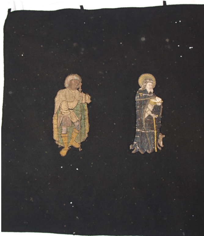
Fig 6. The mourning cloth at Cotehele. The detail shows embroidered figures Saints Roch and Anthony currently applied to cloth of inferior quality.

hanging, it has been thought that ‘the Old Testament prophet Jeremiah looks a bit later in date: this would be from another item’. 35