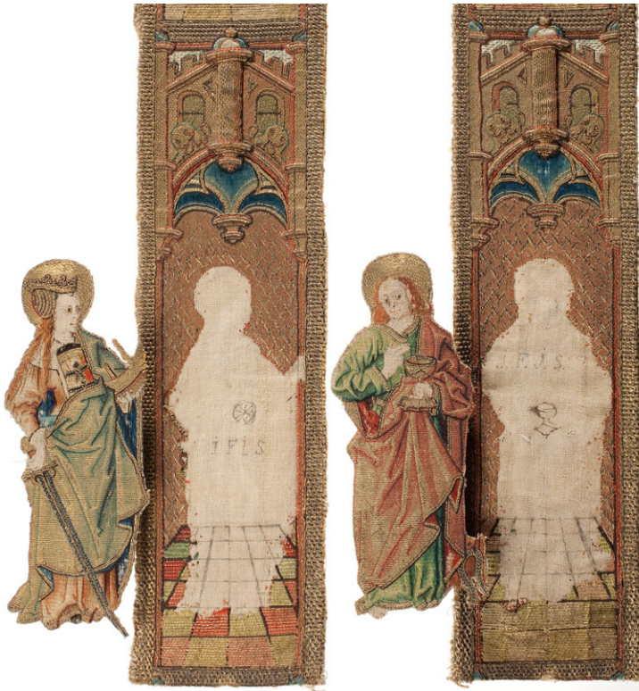
Fig 7. Two orphreys from a dalmatic with detached figures of Saints Catharine and John the Evangelist embroidered on linen by James of Malborch, dated 1504 (acc. nos ABM t2165a01-a02 and b01-b02).

Most often, the embroidered background within the arch would be completed with a tiled floor marked out in perspective, although sometimes the figure under the canopy is shown standing on a grassy ground embroidered with flowers, possibly more commonly seen in work made in England (fig 8). 59 A piece known as the St Mary Arches textile in the Royal Albert Memorial Museum (RAMM), Exeter, displays such imagery. It is made up from parts of a set of vestments dated c 1500, believed to have been saved during the Reformation by removing some of the figures and transforming the textiles into a coffin cover. Although at that time the wearing of vestments was mostly disallowed, palls and altar hangings continued to be used. 60 Embroidered figures still extant on the piece have been identified (from attributes and halos) as Apostles and other saints together with Old Testament prophets who wear the dress of medieval merchants with splendid hats and hold scrolls while making a speaking gesture, much like the Jeremiah figure at Cotehele. 61