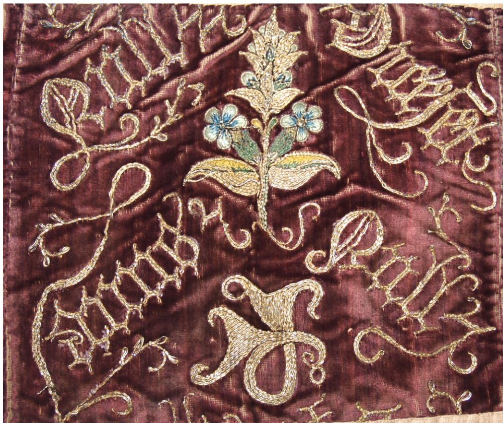
Fig 14. The motto cloth at Cotehele. Detail of the lower band with monogram referring to the wife of Sir Richard Edgcumbe, Joan Tremayne (d 1500).

the embroidery forms a narrower band, the motto is level side-to-side, Null opposite Null etc. 72