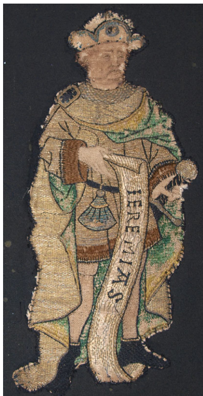
Fig 3. The mourning cloth at Cotehele. The detail shows the Old Testament prophet Jeremiah.