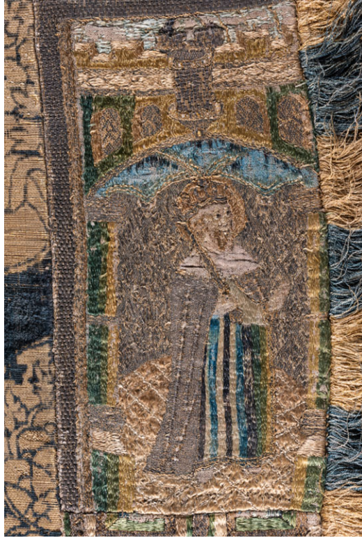
Fig 9. The St Petrock pall at Exeter Cathedral is made up of velvet and embroidery from vestments possibly dating from the fifteenth century. The detail shows embroidery of a figure standing on tiled floor.