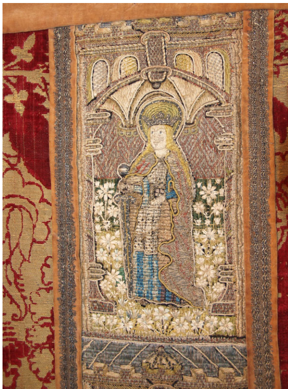
Fig 8. Detail of a hanging Ugbrooke House, Devon, made up from the velvet and embroideries of an early sixteenth-century cope.

Similar imagery and quality of embroidery can be seen in the collection at Exeter Cathedral on the St Petrock Pall, which is also made up of a richly woven velvet cloth and sections of embroidered orphreys pieced together from vestments. Here the canopied figures stand either on embroidered tiles or grass (figs 9 and 10). 62 The execution of needlework found in these two pieces shows less refinement than that of the Netherlands examples, or indeed of the Edgcumbe chapel furnishings. It has been suggested that at Cotehele ‘a red velvet altar dorsal of Christ, the Apostles and St Paul [was] commissioned from a London workshop’. 63 At that time, the majority of professional workshops of the embroidery trade were based in London around the area of St Paul’s Cathedral. Survival of such embroideries is seen to occur in a concentration of locations, particularly in the west and south-west of England and in Wales, where the iconoclasm of the Reformation was less stringently enforced. It is not known whether these pieces were the products of the top London embroiderers or of local craftspeople. Elements of ecclesiastical vestments and furnishings could be acquired from the London workshops to be assembled locally. 64