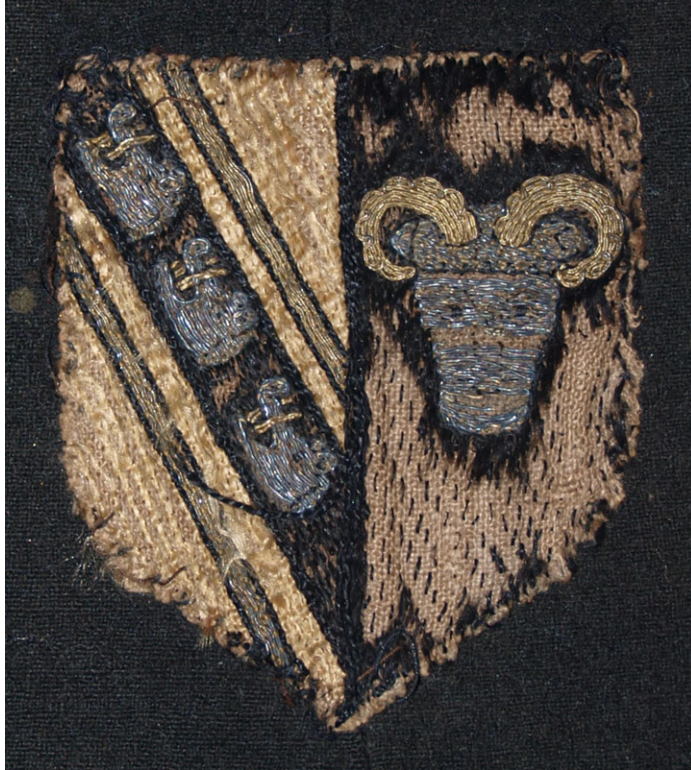
Fig 4. The mourning cloth at Cotehele. The detail shows the Edgcumbe–Durnford embroidered coat of arms.

It seems that the Apostles cloth hung along with a fine black cloth embroidered with the figure of the prophet Jeremiah and several coats of arms, perhaps suggesting that one was a frontal to hang at the face of the altar while the other a dorsal placed above and behind the altar. 19 A description in C S Gilbert's 1820 Survey of Cornwall recorded that: