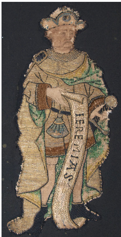
Fig 3. The mourning cloth at Cotehele. The detail shows the Old Testament prophet Jeremiah.