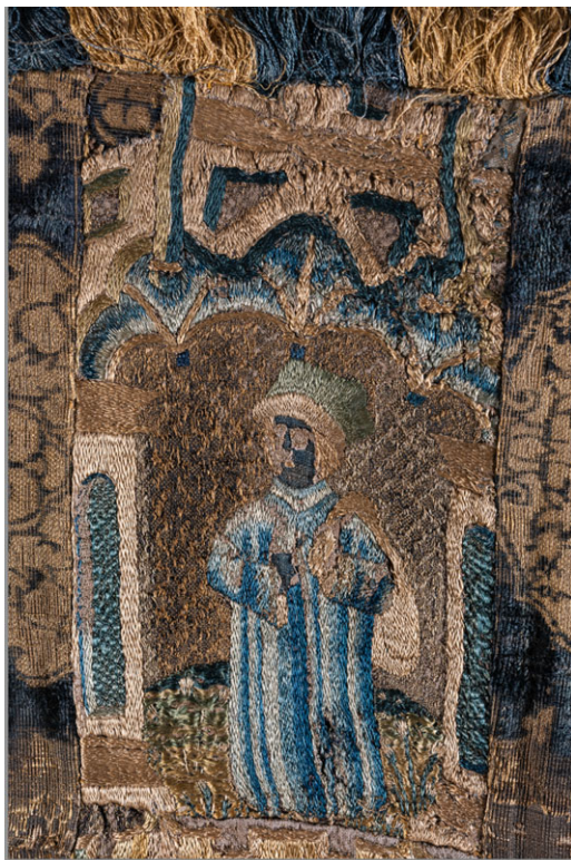
Fig 10. The St Petrock pall at Exeter Cathedral. The detail shows embroidery of a figure standing on grassy flowered mound.

two of the scenes on the Exeter St Petrock Pall, but these are altogether less sophisticated images and, even then, they are worked in silk thread within a fully embroidered background (fig 9).