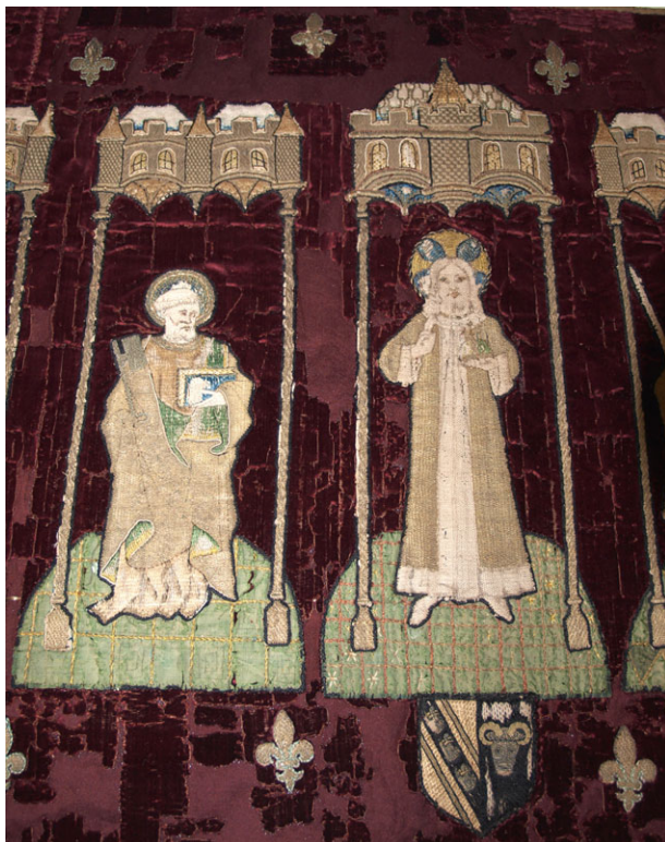
Fig 1. The Apostles cloth at Cotehele. Embroideries dating c 1500 have been applied to a slightly later velvet. The detail shows Saint Peter and Christ above a shield bearing the arms of Sir Piers Edgumbe I and Joan Durnford.

Cotehele to inquire for the two figures missing from the black hanging and found them, as well as the missing shield, attached to an embroidered mirror frame in one of the bedrooms. 11