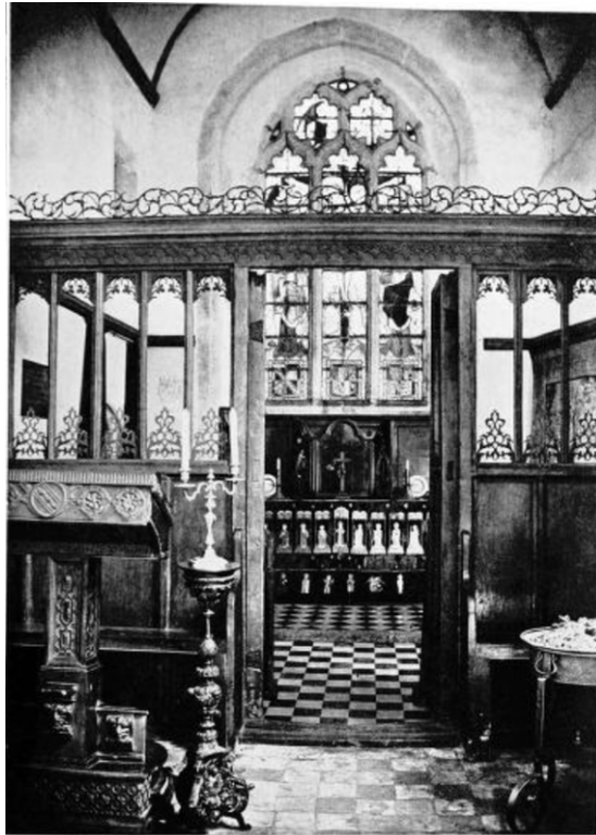
Fig 5. The chapel at Cotehele photographed in 1894 by Alfred Henry Malan.

Cotehele's current black cloth but with only six figures and no Edgcumbe–Durnford shield (fig 5). Malan noted that 'the altar cloths display the most exquisite needlework, though two of the figures of one of them happen to be missing'. From his account of photographing inside the chapel, it would seem that the set-up was carefully – if somewhat dangerously – choreographed with interior lighting provided by 'all the paraffin lamps in the house' while any natural light was excluded by a huge tarpaulin outside the east window. 26 It could be that the two furnishings were especially placed on the altar for the photograph rather than this being their usual situation. 27 An illustration in Christopher Hussey's 1924 Country Life article shows the Apostles cloth still hanging in the chapel as an altar frontal. 28 The angle of the photograph does not allow a view as to whether the black cloth hung below at this time, but it seems unlikely. There is only mention that two other figures, obviously of the same set, 'have been worked into the frame of an early seventeenth-century mirror of stump work character in one of the bed-rooms'. In part II of the article, Hussey more precisely wrote that 'beside the bed hangs a piece of beadwork in a frame surrounding a mirror of about