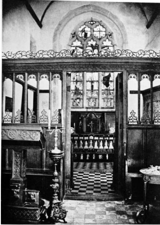
Fig 5. The chapel at Cotehele photographed in 1894 by Alfred Henry Malan.

Cotehele's current black cloth but with only six figures and no Edgcumbe–Durnford shield (fig 5). Malan noted that 'the altar cloths display the most exquisite needlework, though two of the figures of one of them happen to be missing'. From his account of photographing inside the chapel, it would seem that the set-up was carefully – if somewhat dangerously – choreographed with interior lighting provided by 'all the paraffin lamps in the house' while any natural light was excluded by a huge tarpaulin outside the east window. 26 It could be that the two furnishings were especially placed on the altar for the photograph rather than this being their usual situation. 27 An illustration in Christopher Hussey's 1924 Country Life article shows the Apostles cloth still hanging in the chapel as an altar frontal. 28 The angle of the photograph does not allow a view as to whether the black cloth hung below at this time, but it seems unlikely. There is only mention that two other figures, obviously of the same set, 'have been worked into the frame of an early seventeenth-century mirror of stump work character in one of the bed-rooms'. In part II of the article, Hussey more precisely wrote that 'beside the bed hangs a piece of beadwork in a frame surrounding a mirror of about