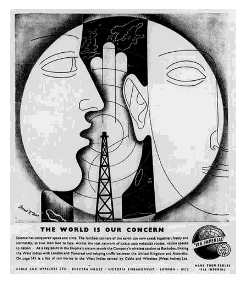
FIGURE 6. A 1945 advertisement for the Cable and Wireless station in Barbados.

out harming or hindering others. It is a vision of diplomacy, cosmopolitanism, and modernity.