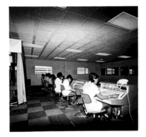
FIGURE 5. Cable and Wireless's post-War cosmopolitanism (from Barty-King 1979).

dies with London and Montreal and relaying traffic between the United Kingdom and Australia.