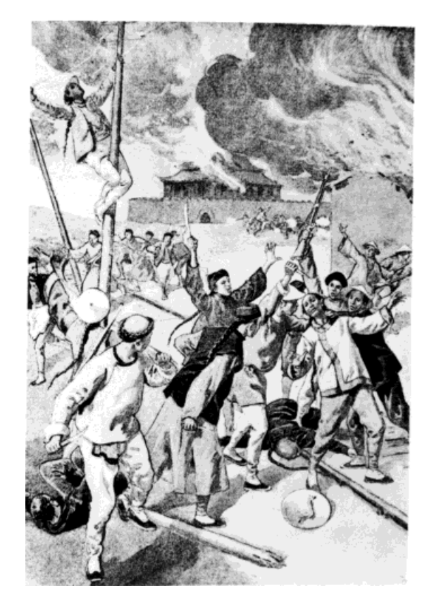
FIGURE 1. Cable-cutting rebels in late imperial China; from Baglehole 1969.

agreements with the Ottomans, raising necessary capital after the failure of the land lines in Egypt (Barty-King 1979:15), and colonial unrest (Baglehole 1969:1). As late as 1900, cable-cutting rebels continued to disrupt British engineers' plans for a worldwide cable system, demonstrating that colonial subjects well understood, even if colonial engineers often did not, the deeply political and contested nature of telecommunications technology—that such technology provided a means for control, not just a means for communicating over long distances (see Fig. 1). Submarine cables provided an expedient solution, circumventing the possibility that colonial insurrections would get in the way of imperial communication and command. In 1858, as the British Government took over the affairs of the now-failed East India Company, the head of the British Board of Trade commissioned Charles Bright, a cable engineer who was later knighted, to produce a report on "The Establishment of Telegraphic Communication in the Mediterranean and with India," which was published in 1859 (Barty-King 1979:16).