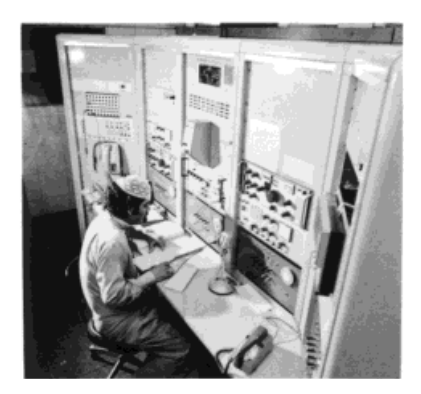
FIGURE 4. Cable and Wireless's post-War cosmopolitanism (from Barty-King 1979).

noted "difference" but emphasized the way technology bridged those differences. If we can all speak to each other, thanks to the technology of Cable and Wireless, we can all come to an understanding with each other.