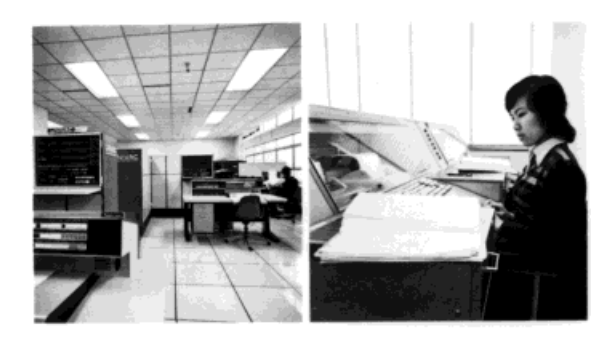
139-41 The Message Switching Centre at Hong Kong (absv h(t)) was first computerised in 1969, and a fully computerised Telex exchange was installed in 1972. But the system still needed the human touch In 1979 Hong Kong branch of Cable and Wireless bad a mainly Chinese staff of 2.200 – one of them is seen operating a computer (absv right). The latest technology is also applied to the installations in the West Indies, (Bdwa) locally-trained gibts at cordina technology is also applied to the installations of the West Indies, (Bdwa) locally-trained gibts at a cordina technology of the on Antigua.