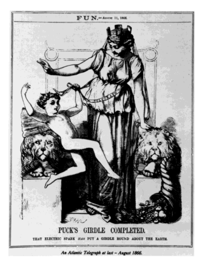
FIGURE 2. A girdle 'round the earth: late nineteenth-century Cable and Wireless iconography (from Barty-King 1979).

At its formation as Imperial and International Communications, Ltd., the communications company adopted the phrase, "Via Imperial," to describe its network of cable and wireless routes. Images of Roman goddesses girdled by coaxial cables, popular in the nineteenth century (Fig. 2), gave way to images of the globe, interconnected by the "thin, red lines" (Graves 1946) of cable and wireless routes. The frontispiece to Graves's book of that title (Fig. 3), a history of Cable and Wireless during World War II, is illustrated with reproductions of the clock faces at Electra House, the company's base of operations. The two clock faces represent the northern and southern hemispheres, from vantage points above the poles, and, as the caption indicates, can "show the time in any