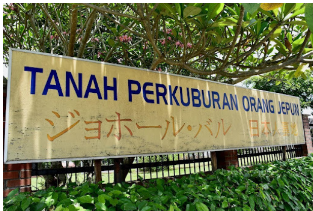
Fig. 6. Japanese Cemetery in Johor Bahru - Entrance

Almost 5,000 km away from Osaka, at the southern end of the Malay Peninsula, just north of Singapore, lies the city of Johor Bahru, the capital of the state of Johor in Malaysia. Here, in an isolated part of the urban sprawl, one can find a Japanese cemetery (Fig. 6) which purportedly was established in 1917 to meet the needs of the Japanese diasporic community which, at the time, was connected largely to the local rubber plantation (Shimizu 1993) and other companies looking to increase their operational foothold in Southeast Asia.