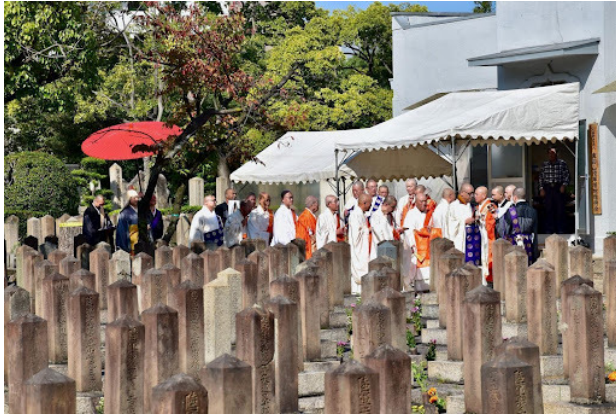
Fig. 5. Sanadayama Cemetery - Preparation for Buddhist ceremony, 27 October 2018

Osaka, regard it to be a more important commemorative space than Yasukuni ( Rakuten Infoseek News 22 August 2018).