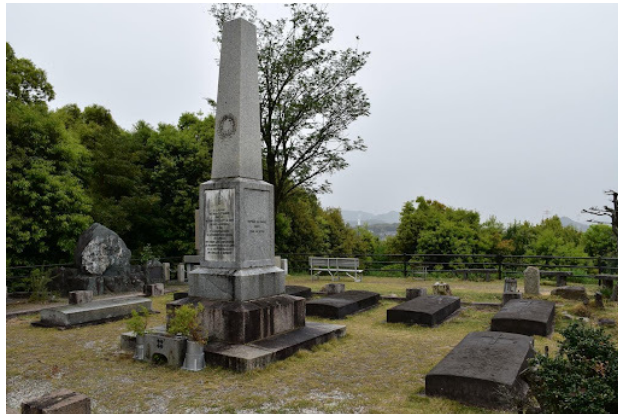
Fig. 3. Hijiya Army Cemetery, Hiroshima - Cenotaph and graves of French soldiers

preservation is an obvious intimation of Japan's position in the geopolitical arena during a significant regional clash (Fig. 3).