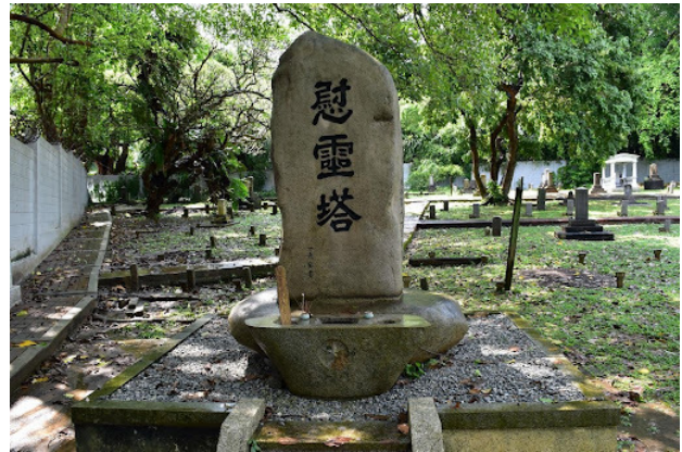
Fig. 8. Japanese Cemetery in Kuala Lumpur - Ireitō

Lumpur (Fig. 8) is dedicated to the consolation of the spirits of the dead, but not just those of the Japanese.