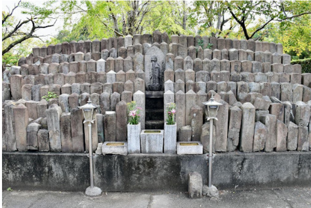
Fig. 1. Gravestones at Sanadayama Cemetery

unidentified bodies, all of whom have experienced or died as a result of Japan's world-spanning confrontations in its rise as a modern nation and empire (Fig. 1).