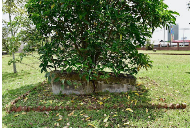
Fig. 7. Japanese Cemetery in Johor Bahru - the Yamashita Battlefield Memorial found in 1982

This being a Japanese cemetery dedicated to the Japanese dead, the graves of local Malayan people who endured exploitation and even death under Japanese occupation are patently absent. However, only a short walk away from this site, a separate monument was built by the state of Johor, which is dedicated to the victims of systematic massacres of locals known as “ sook ching ,” a term variously translated as “purge through purification” or “purge through elimination” (Melber 2019 and Blackburn 2000) during the Japanese occupation of Malaya (1942-45). The monument is a mass grave for more than 2,000 people killed between February 25 and March 31, 1942, and it is one of more than a dozen similar memorials erected throughout the Johor state that commemorate Japanese atrocities (Lim Pui Huen 2000).