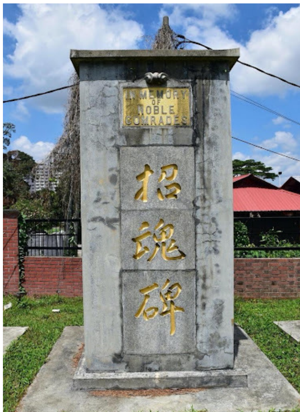
Fig. 9. Japanese Cemetery in Johor Bahru - Shōkonhi (Memorial to the Loyal war dead)

The Johor cemetery is a minor one in the informal network of similar sites scattered throughout Southeast Asia, especially when one compares it to the more distinguished, well-funded and well-maintained Japanese cemeteries in Singapore and Kuala Lumpur. While it receives visitors, these are mainly