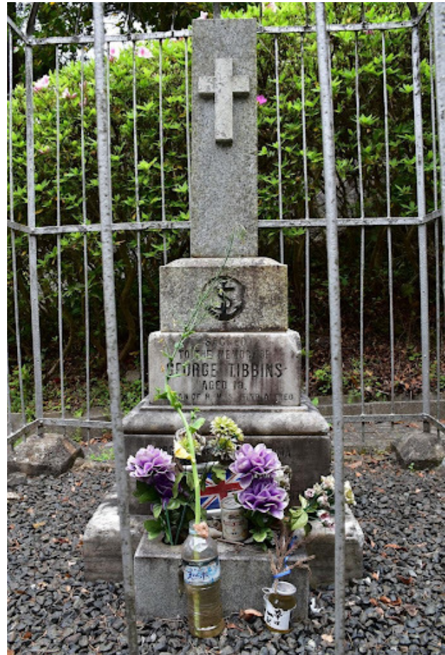
Fig. 4. Kure Naval Cemetery - George Tibbins' grave

At Kure Naval Cemetery ( Kure Kaigun Bochi ), among the 91 collective cenotaphs and 157 individual monuments, there is the grave of George Tibbins, an English sailor who died in 1907 at the age of 19 during a naval exercise near Miyajima Island. His grave's ongoing preservation has become a symbol for the Anglo-Japanese friendship in the early twentieth century (Fig. 4). It also signifies a sense of ascending power in the world of competing empires following Japan's victory in the Russo-Japanese War.