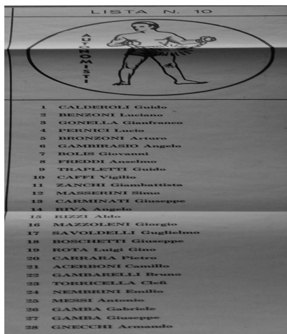
Figure 1. The MAB's first electoral list for the 1956 administrative elections.

campaigns in regions outside Lombardy. Campaigning in piazzas in Trieste and then Friuli gave many of the Bergamascan activists their first taste of the art of oratory instead of simply putting pen to paper, and the process inspired a desire to stand in elections (Freddi 1963, 14).