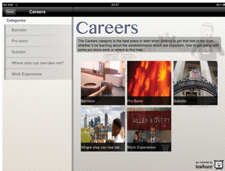
Figure 2: Lawbore

Information architecture – The Learnmore website had become unwieldy; the existing wiki structure meant that we were tied to just the six categories and then no sub-categorisation within these. The larger the number of resources within them, the less easy it was to find what you needed. We didn't want this to be the case within the app, and so needed to re-categorise all content into new areas. Another issue was that the website had videos on only three separate pages (Top tips, Mooting Video