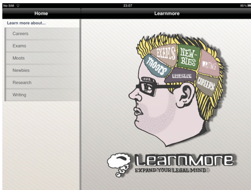
Figure 1: Learnmore

Initially, we had thought about developing the Learnmore website into an app for mobile phones but through discussions with our developer, we came to understand that when dealing with resources which may be text heavy or require a high level of interaction, a larger screen such as that on an iPad, would be far more suitable, simpler and user-friendly than smart phone like an iPhone.