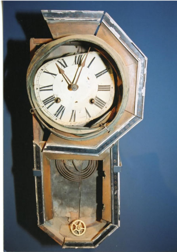
Figure 3. A wall clock found at the site of the bombing, stopped at 11:02.

August, the alerts were lifted and people, machines and trains began to resume their daily activity. People lined up at food distribution points throughout the city. At the Nagasaki Medical College (now the Nagasaki University School of Medicine), lectures were started and the hospital received patients. 2