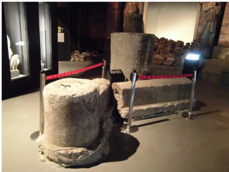
Figure 5. The Ohashi bridge post.

The destructive force of an atomic bomb is comprised of three elements: radiation, heat rays and blast wave. Along with them comes a conflagration that causes even greater destruction. It is thought that approximately 50% of the Nagasaki bomb's explosive energy was released in the form of a blast wave, 35% as heat rays, and 15% as radiation. 5