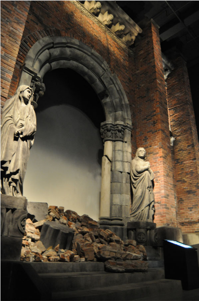
Figure 6. A portion of the Urakami Cathedral, now housed in the Nagasaki Atomic Bomb Museum.

atomic explosion. It is assumed that the clock was stopped at 11:02 due to the impact of the blast, which destroyed the entire house.