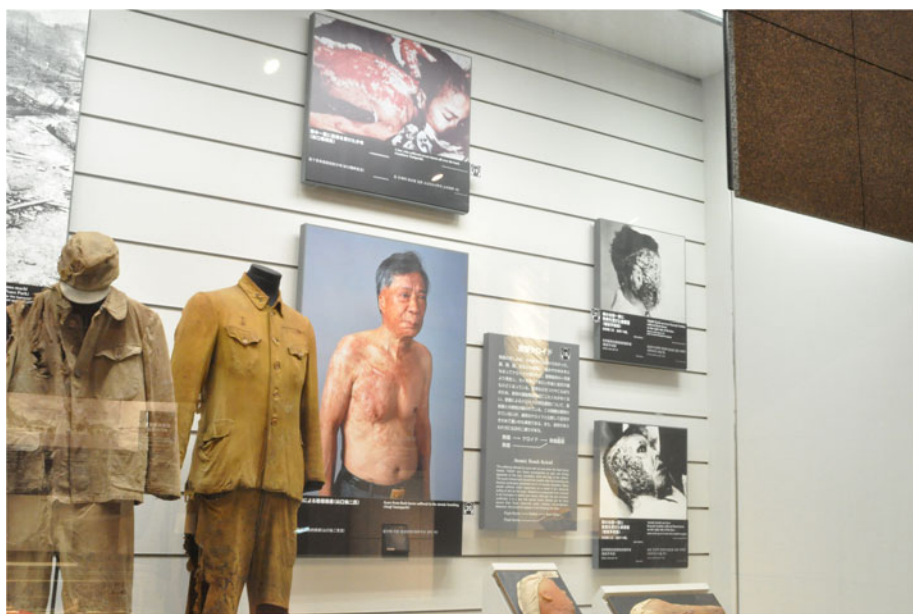
Figure 7. A display showing some of the injuries suffered by survivors.

On 9 August 1945, the atomic bomb detonated in the air just 500 metres from the cathedral, completely destroying it. In the Urakami diocese, which had survived years of persecution, 8,500 of its 12,000 members perished. 7 Thus, the bomb did more than take lives and destroy buildings; it also obliterated the community, history and neighbourhood connections that had been built in Urakami amid great hardship.