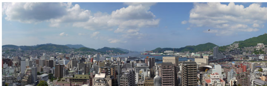
Figure 8. Nagasaki today.

appears in two photos is Mr Katsuji Yoshida. All three were gravely injured by the bomb when in their mid-teens but somehow survived. In the years following the war, they continued telling people about the horrors of the bomb and participating in peace activities that demanded the abolition of nuclear weapons.