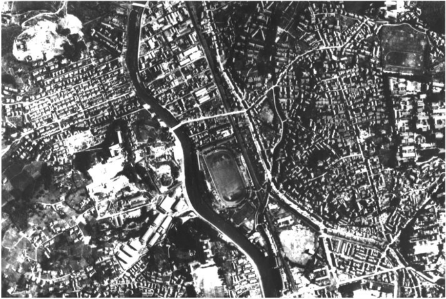
Figure 1. The hypocentre on 7 August 1945, two days prior to the atomic bombing of Nagasaki, photographed from the air by US pilots.