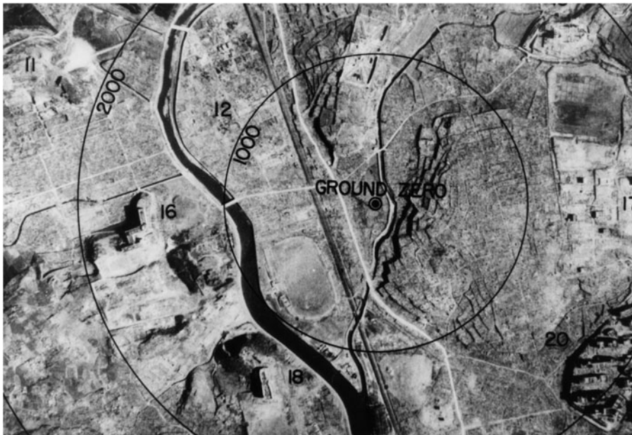
Figure 2. The hypocentre one month after the atomic bomb was dropped on Nagasaki.