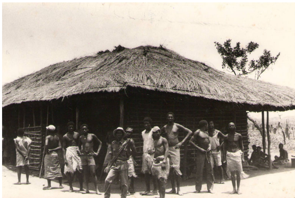
Fig. 5. Detainees and a warder posing for a photograph in Unango. This photo was taken during the construction of one of the camp's barracks. The detainees wear fodder sacks during work to avoid damaging their uniforms – the only clothes they had. The fact that only one warder posed for the photo indicates that there were in fact very few armed warders in the camp. Undated.

The nationalized clinics and schools also needed security. The departure in June 1975 of the last company of Portuguese troops that had helped Frelimo secure the transition made the security situation more critical. The start of the war with Rhodesia in 1976 squeezed the army even more. As Rhodesia's aggression evolved into a civil war led by Renamo in the late 1970s and throughout the 1980s, the war effort consumed almost all the newly recruited cadres. 40