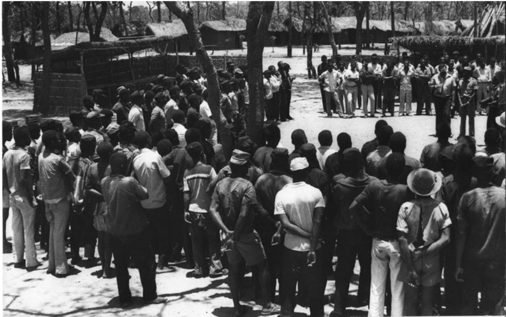
Fig. 2. Detainees in a meeting at M'sawize. Some still wear the black uniform or what remained of it. 1976.

villages near their camps, and the envy with which they were often met because of their 'good looks' in black fatigues. In Niassa and Cabo Delgado, for example, detainees were known as Mkunya Woripa , or 'white blacks'. As former detainee Ché Mafuane told me, ' mkunya woripa means that the person is black but at the same time he is white because he was dressed.' 23 The label white does not stand for race here, but rather for social status. For the Macua-speaking people in the remote corners of northern Mozambique, the detainees were somewhat privileged because they were dressed and 'looked good' in their black garments. On the one hand, this is a clear indication of the level of scarcity and neglect in which local populations lived. On the other, it highlights the cultural and social gap between the rural people of the northern provinces where most camps were established and the detainees who were mostly urban people. That these urbanites – who appeared privileged in the eyes of the rural populations – had to be fed and dressed by the state must have caused a great deal of confusion.