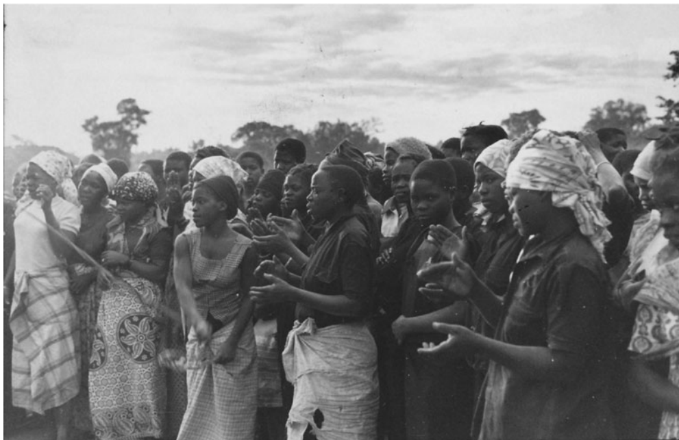
Fig. 1. Female reeducatees welcoming the Notícias reporter in M'sawize. Their hair was cut short as an attempt to clear off the signs of urban degradation and alienation (wigs and straightened air). August 1976.

The reporter's visit to Niassa was meant to document the progress of women detained for prostitution and to soothe the minds of those who had doubts about the righteousness of the reeducation program in Mozambique. At a time when concerns about human rights abuses were being raised domestically and internationally, the reporter's lengthy article was meant to counter the 'rumors' that the camps were sites of macabre punishment. 3