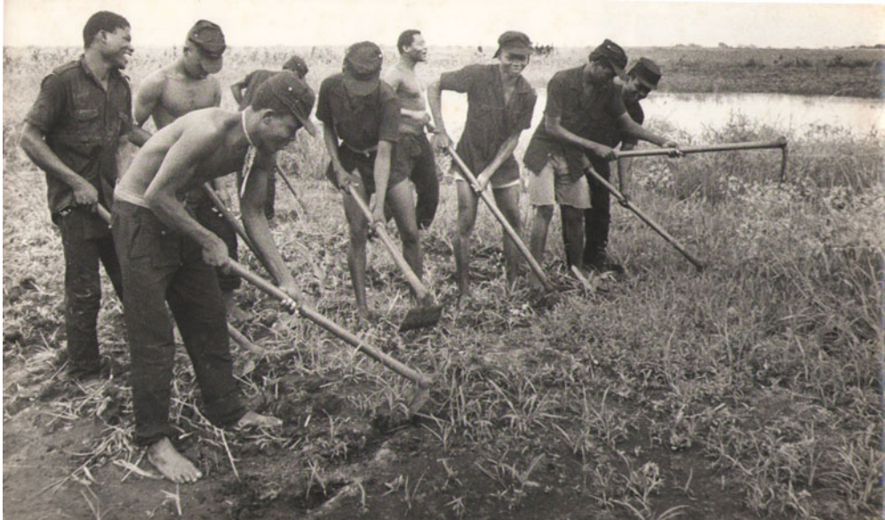
Fig. 6. Detainees at work in Inhassune, 1976.

There was no order to eating time. As soon as their rusty iron dishes were filled, the reeducatees sat wherever they found appropriate in the vast open camp in the company of close inmates or friends (see Fig. 7). In his Kafka-esque novel Campo de Trânsito , Mozambican fiction writer and historian João Paulo Borges Coelho captured the eating time in the reeducation camp with satirical yet very informative detail. 60 Most detainees were modern urbanites who had assimilated the Portuguese colonial notion that cutlery was a symbol of civilization. For most urban southerners, eating with at least a fork or a spoon was the norm, whereas eating by hand was tantamount to backwardness. In the camps, detainees had to learn how to eat by hand, for cutlery was a luxury that only few – often senior detainees – could afford. Like other metal tools (such as knives), forks and spoons were markers of hierarchy inside the camp. Those who obstinately maintained their ‘civilized’ ways of eating used bark or hardened leaves in place of spoons. 61