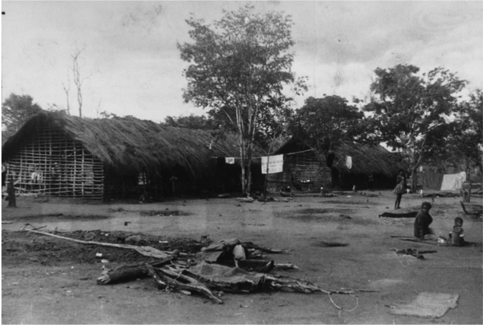
Fig. 3. Dormitories for female detainees and their children in M'sawize. Note the unprotected walls, which left detainees exposed to cold and nature's other elements. August 1976.

modern shape of square houses and regular lines. 29 As primary locations for moral purification of 'anti-socials', reeducation camps had to be organized according to this orderly form, not so much for legibility or surveillance considerations. The orthogonal shape of the camp was to express human conquest of nature according to scientific methods (an important component of reeducation). Circles were primitive, while squares were modern and rational.