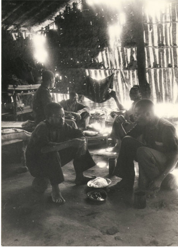
Fig. 7. Detainees sharing a meal inside their hut in Unango. Note that one detainee (front right) has a spoon, while others eat with their hands. In some camps, cutlery was a symbol of status. Undated.

resource-poor that overseers had to go to certain lengths to distinguish themselves from the captives.