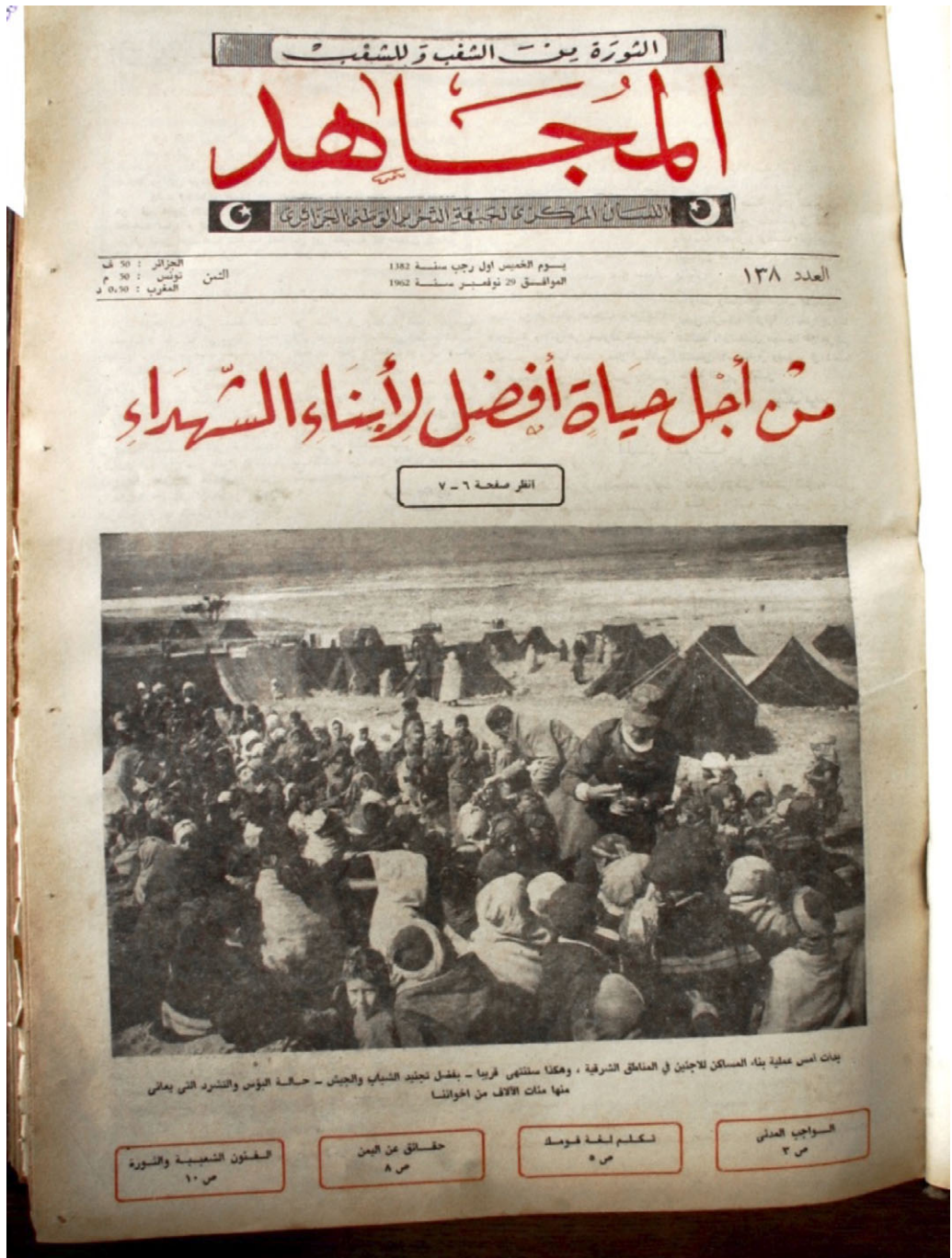
Figure 3. al-Mujāhid , 29 Nov 1962. “For a better life for the children of the Martyrs. Yesterday began the house-building operation for refugees in the Eastern region. And so, thanks to the mobilisation of youth and army, the situation of misery and homelessness that hundreds of thousands of our brothers are suffering will soon come to an end.”