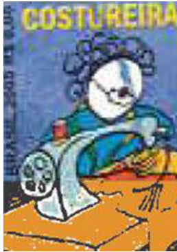
Fig. 2. Brazilian stamp.

on it (one of which most appropriately showed a very curly haired Costureira; see Figure 2). The letter was written in 20-pt font (mostly in caps) which included the very memorable line ‘I AM A DEALER IN BRAZIL’, a request for exclusivity and an intriguing question about whether the pills were for ETERNAL use.