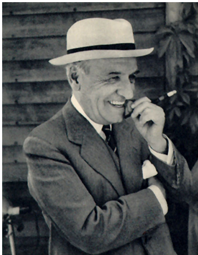
Figure 1. José Ortega y Gasset in Aspen, Colorado, 1948. Public domain image. Source: Wikimedia Commons.

de la contaminación ” (the pedagogy of contamination). 2 By this he meant an approach to teaching that recognizes that much of what is important in education is caught, not taught, and that the teacher’s main role is not to transmit what is settled but to “contaminate” students with the habit of searching, questioning, challenging, and unsettling established beliefs. The lecture ended on a personal note in which he insisted—too modestly, but not inappropriately given the extraordinary diversity of Ortega’s intellectual interests—that he was not really a philosopher, just someone who makes people reexamine their assumptions, as if he were throwing little stones into a pond to unsettle the reflection in it of the clouds floating across the skies above. This article explores the development of this distinctively Socratic and frequently radical educational thought and its sources within Ortega’s wider philosophy.