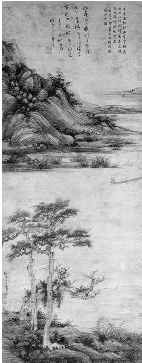
PLATE 2. Hermit fisherman on Lake Dongting. Wu Zhen's poem is second from the top right-hand corner.