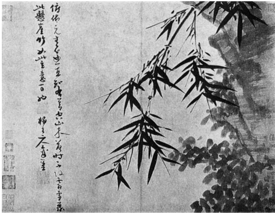
PLATE 5. From Manual of ink bamboo (eighth in series).

The [bamboo] stands upright in the frost, Its shadows are slim and graceful under the moonlight.