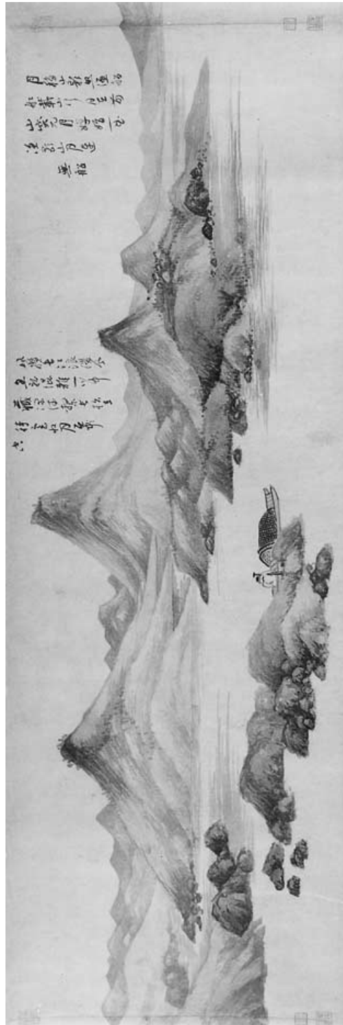
PLATE 3. Fisherman's scroll (section) (Courtesy of the Freer Gallery of Art, Smithsonian Institution, Washington, D.C.). Wu Zhen's poem is second from the top right-hand corner.