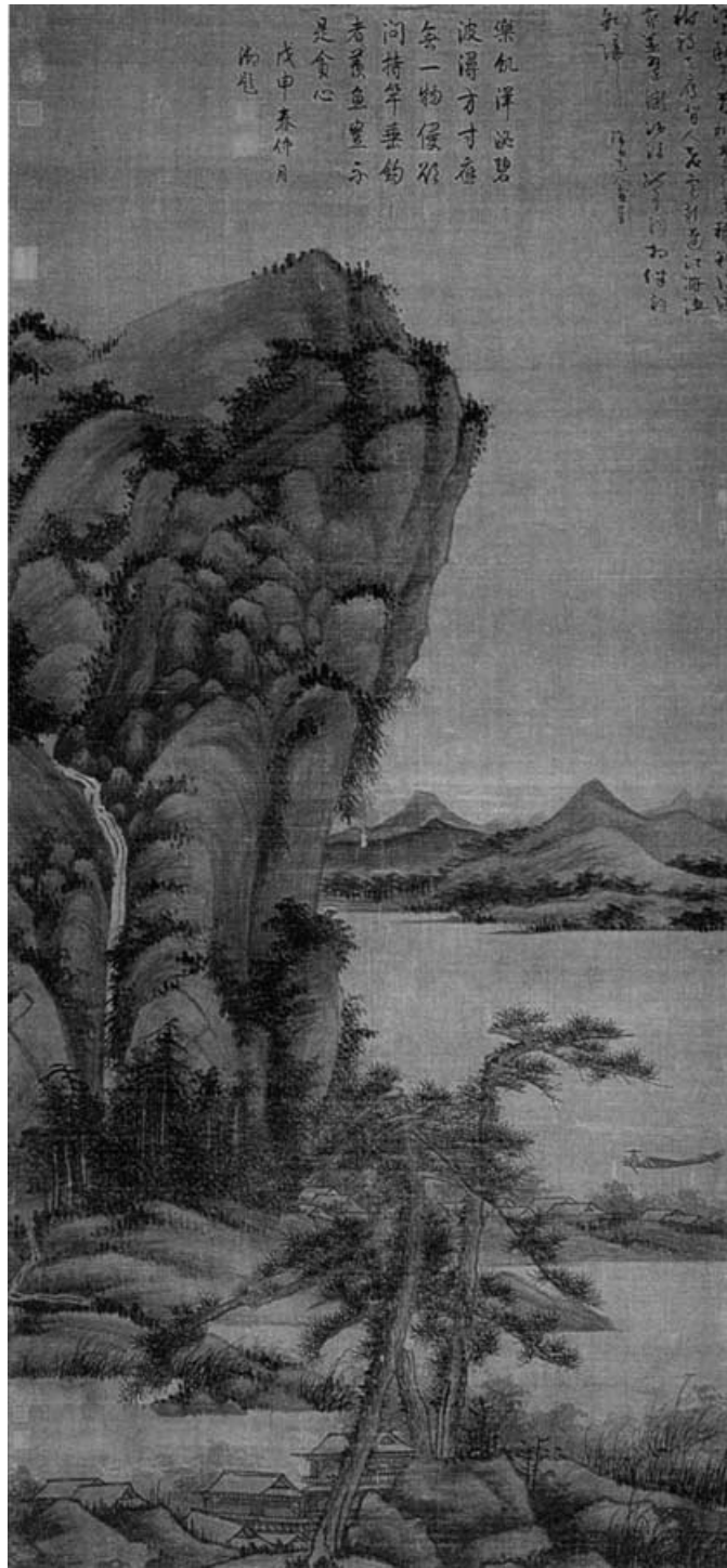
PLATE 1. Hermit fisherman on an autumnal river (Courtesy of the National Palace Museum, Taipei). Wu Zhen's poem is in the top right-hand corner.