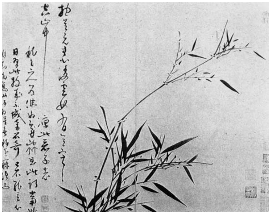
PLATE 6. From Manual of ink bamboo (eleventh in series). Wu Zhen's poem, first two lines from the right.

Wu also praises the quiet, graceful and elegant manner of the bamboo, as well as its aloofness from the world with lines such as: