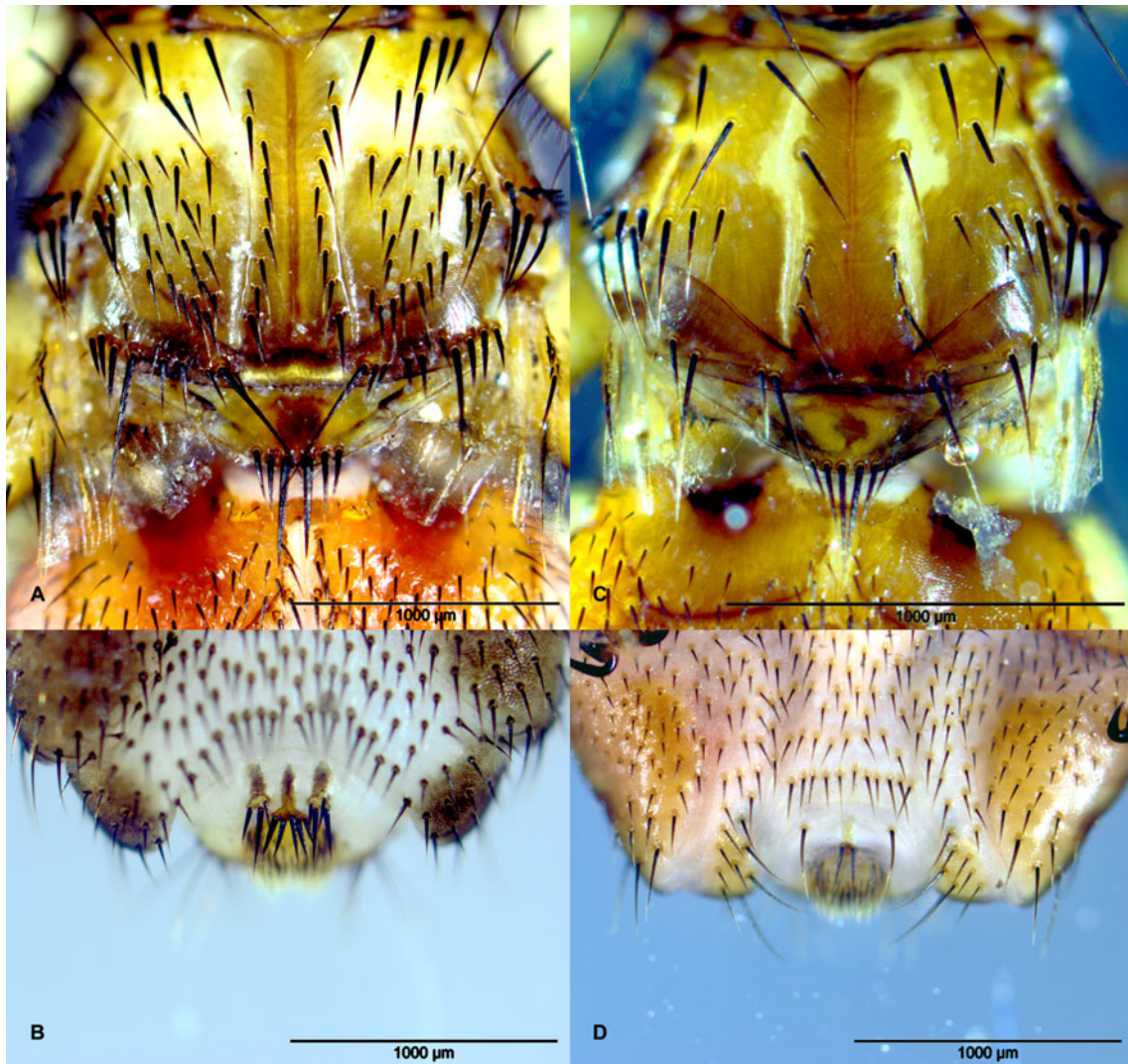
Fig. 2. Features on the thorax and female terminalia of Lipoptena cervi (A, B) and L. fortisetosa (C, D).